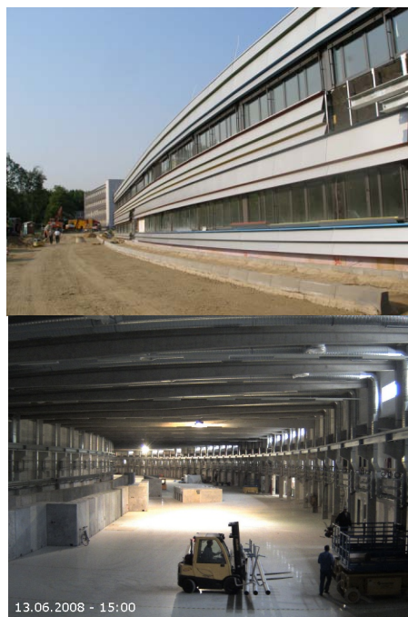
Figure 1: upper half: Facade of the hall; lower half: view into the new hall with the concrete shielding blocks on the left

In order to maintain the high brilliance of the undulator radiation to the sample position special measures have to be taken to reduce the impact of vibrations and cultural noise and to guarantee the positional stability of the radiation. To avoid that any motion of the walls of the hall, for example caused by wind and crane motion, is coupled to the experimental floor the walls rest on 99 piles of 1m thickness. These piles are rigidly anchored at 20 m depth and the upper half of the piles is insulated from the surrounding by a 2 cm thin elastic foil to ensure decoupling of the walls and the floor. The work on the piles, the building shell was finished in November 2007 and this event was celebrated during the topping-out ceremony on the 26 th of November.