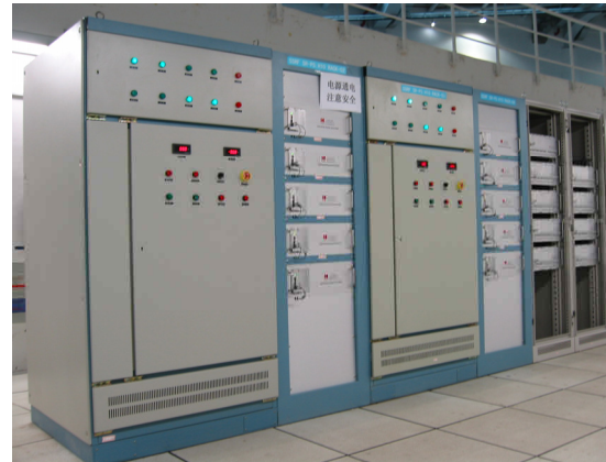
Figure 6: Quadrupole power supply in the storage ring

Two hundred sets of chopper type power supply were designed to excite the main windings of 200 quadrupoles respectively. Every five choppers share a common DC link voltage source. The stability of the output current can be \pm 2 \times 10^{-5} for 24 h.