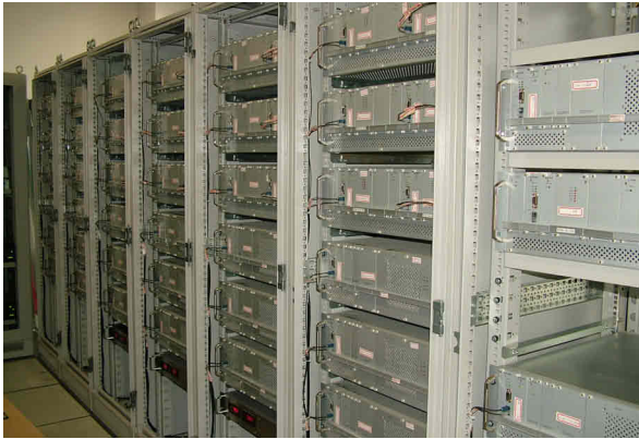
Figure 3: The linac power supply

In the booster ring, six sets of dynamic power converter run at the repetition rate of 2 Hz for 48 dipoles, 56 quadrupoles and 46 sextupoles.