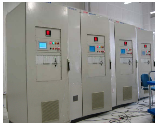
Figure 7: Sextupole power supplies in the storage ring.

All the power supplies in the storage ring work with the digital power supply controllers designed by PSI.