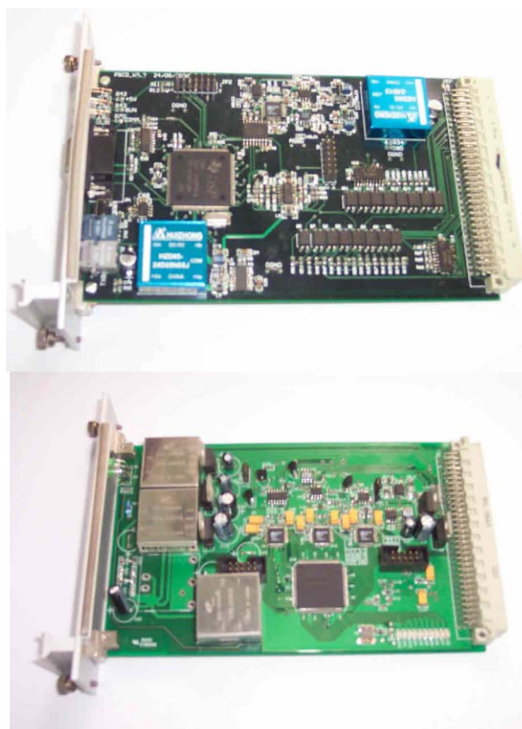
Figure 2: The digital power supply controller developed at SINAP

One cost-effective power supply controller was developed at SINAP, with a stability of up to 20 ppm. They are used in median size and small power supplies in the injector. The controller uses TMS320F2812, which has a clock of 150 MHz with 25 ns time resolution of PWM. Their digital Input and Output ports, electrically isolated from each other, are in 8 bit. The controllers communicate with EPICS via Ethernet and Serial port server by optical fiber, or with local PC by RS232.