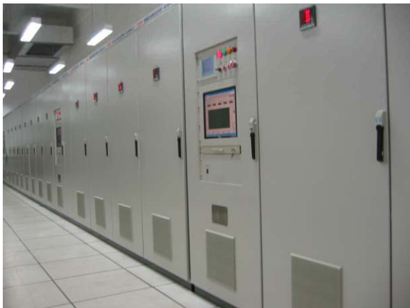
Figure 4: The booster power supply