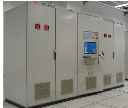
Figure 5: Dipole power supply in the storage ring

Most magnet power supplies in the storage ring are static. It is important for them to work with higher precision, stability and repeatability. For example, a static power supply for 40 bending dipoles, an IGBT type converter rated at 800A/840V, has a long term stability of is 20 ppm in 24 hours.