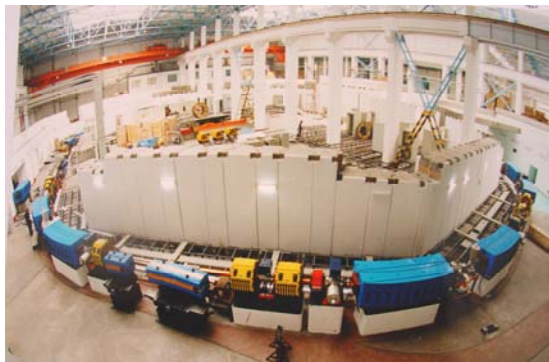
Figure 3: Overview of CSRm installation

The main performances of devices are met design as follow [4,5,6,7] : D-pole of integral field BL accuracy < \pm 1.5 \times 10^{-4} , Q-pole gradient \Delta K/K accuracy < \pm 1.5 \times 10^{-3} ; power supplier of long term stability 10^{-4 \sim -6} , cycle to cycle repetition error < \pm 4.0 \times 10^{-4} ; vacuum 10^{-9 \sim -10} mbar without baking, 10^{-11} mbar after baking, 10^{-12} mbar with titanium pump; RFs frequency range from 0.25~1.MHz with V_{\text{max}} = 8.25\text{kV} and 6.0~14MHz with V_{\text{max}} = 25\text{kV} respectively. All setup were alignment at very high accuracy (error \pm 0.1 \sim 0.3\text{mm} ).