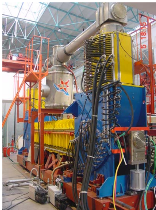
Figure 4: 300kV electron cooler at CSRe

The main performances of CSRe are similar as those of CSRm event heavy magnet devices, C type dipole, large power supplier and big vacuum chamber.