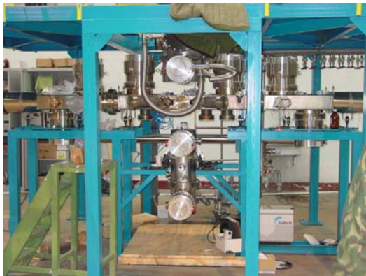
Figure 5: Gas jet internal target at CSRe

The first commission beam is 7MeV/u 12 C from SFC and injects into CSRm by stripping since higher injection beam intensity and easy to operation in beginning.