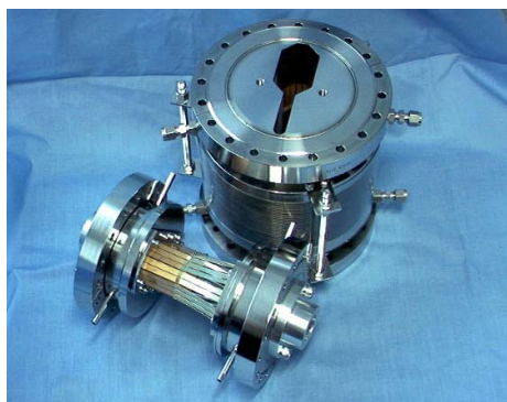
Figure 4: Bellows and its inner RF shielding structure

The RF shielded bellows, located at the longitudinal joint between two vacuum chambers, can fit the vacuum chamber during installation, compensate the machining and installing error, absorb the expansion and the compression of the chamber caused by temperature change. Because the ordinary bellows has large impedance, which will cause beam instability and HOM loss inside it, the movable RF shielding structure should be settled inside it. A new type of double-finger RF shielding structure[3], as shown in Fig. 4, is adopted in SSRF storage ring. The peripheral spring fingers made of Inconel 625 press the Be-Cu contact fingers tightly on the beam tube. Properly select the force to keep a good electrical contact between the contact fingers and the beam tube when the bellows moves in certain range. Welded bellows are used outside the assembly. Both sides of the bellows have cooling channels. In R & D, two typical bellows are successfully designed and fabricated. Their maximum longitudinal moving range is -33\text{ mm}\sim+10\text{ mm} . The allowable transverse offset is \pm 2\text{ mm} . The contact force between the contact fingers and the beam tube is about 120 g/finger. All the data can fulfill the storage ring requirements. The high power load test for the bellows prototype was conducted in cooperation with KEK in Japan. The results confirmed that the bellows could be used in SSRF.