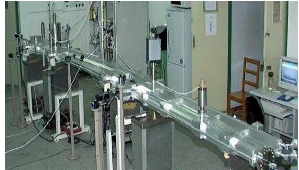
Figure 2: The prototype of the vacuum chamber

As the collimator for the extracted SR and the absorber for the unused SR power, the SSRF storage ring photon absorbers need absorb 90% of the total radiated power. The absorber, 1.6 m from the light source and with 140