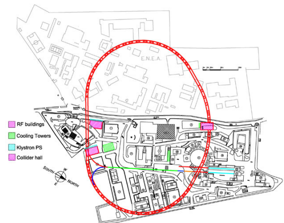
Figure 1: SuperB footprint at LNF.