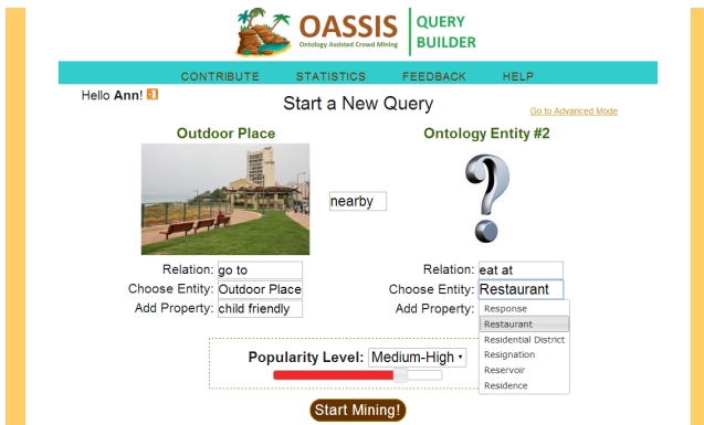
Figure 4: Query builder screen