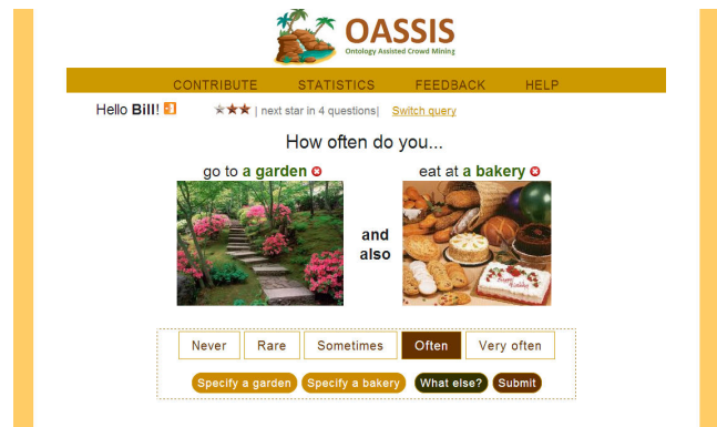
Figure 5: A question to the crowd

via the Foursquare API 2 . In general, any third-party RDF ontology can be used. CrowdCache is a database that stores the computed variable assignments along with the answers collected from the crowd for each assignment.