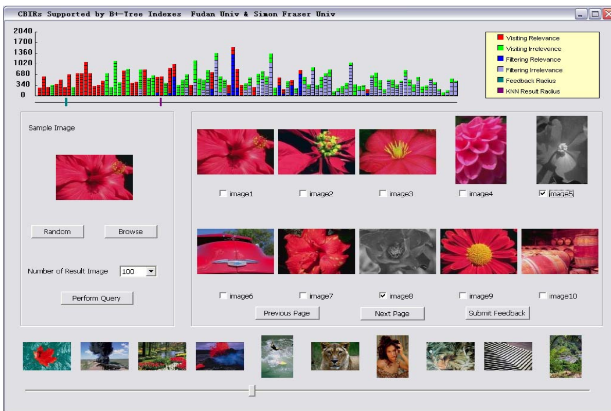
Figure 3: Demo system interface

Second, in the index construction, we use principle component analysis (PCA) to find the principle component with the maximum deviation in the data set, and use the best reference point in the component as the index reference. This is similar to the method in [9]. The best reference point in the principle component with the second largest deviation is used as the filtering reference to define the estimated distance. Then, the estimated distance is stored in the index, and does not need to be computed online.