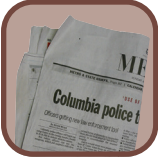
Newspaper & Inserts