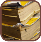
Phone Books (recycle covers with cardboard)