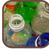
Plastic Jugs & Bottles (No. 1 through No. 7 - No Styrofoam)