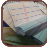
Notebook & Computer Paper