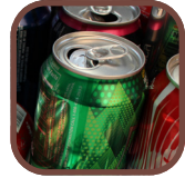
Metal Cans (aluminum foil, trays, steel & aerosol)