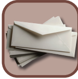
Junk Mail (shred personal information)