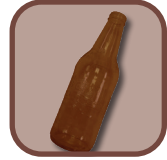
Glass Bottles, Jugs & Jars