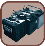
Batteries (all types)