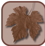
Yard Trimmings (no plastic bags)