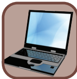
Electronics (erase all data)