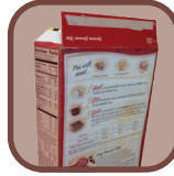
Cereal & Snack Boxes (empty & flatten)