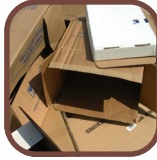
Cardboard Boxes (empty & flatten)