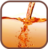
Used Motor Oil