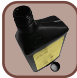
Motor Oil Bottles