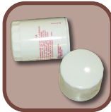
Motor Oil Filters