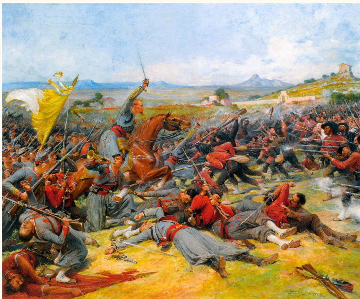
The Battle near Mentana (c 1907) Lionel-Noël Royer