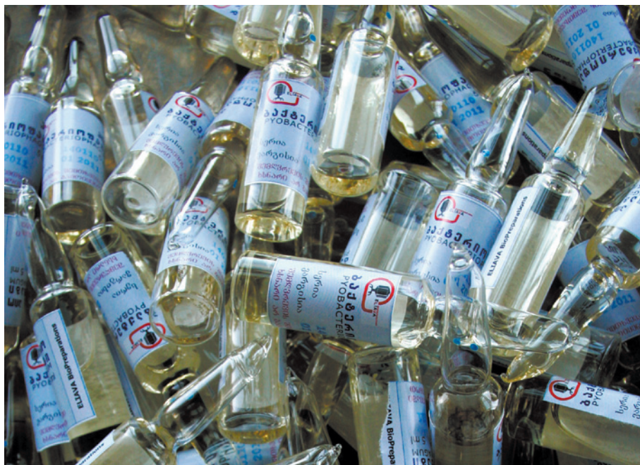
Bacteriophages could be a resource for fighting drug-resistant bacterial infections.