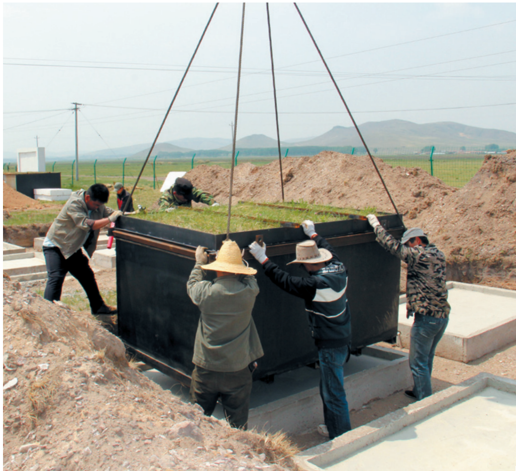
Sections of Mongolian grassland will undergo climate-manipulation analysis at the Duolun research centre.