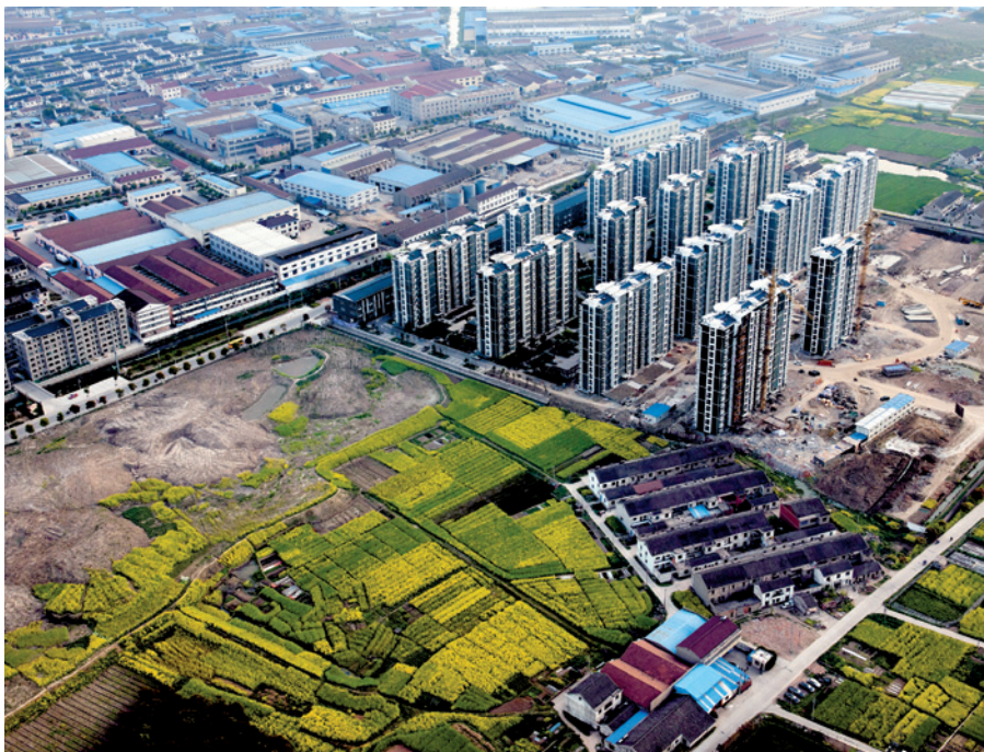
Development in the city of Jiangyin, which lies close to the Yangtze River near China's east coast.