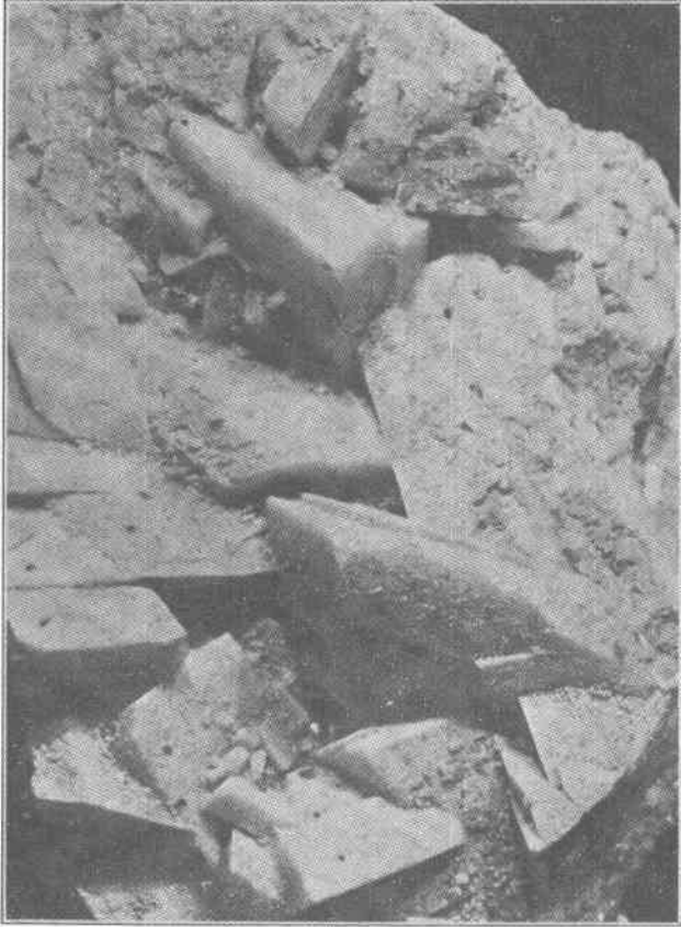
COLEMANITE PSEUDOMORPHOUS AFTER INYOITE FROM DEATH VALLEY, CALIFORNIA