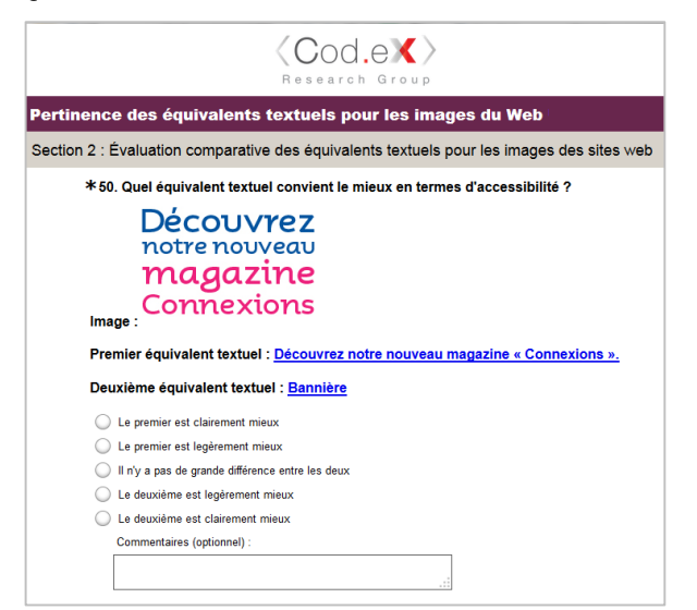
Figure 2: Evaluation environment.

SurveyMonkey was the evaluation environment that best served our study purposes. The survey was written in French and consisted of a first section covering demographic questions, a second section where the 110 images and their two text alternative proposals were presented, and a third section including a brief post-task questionnaire.