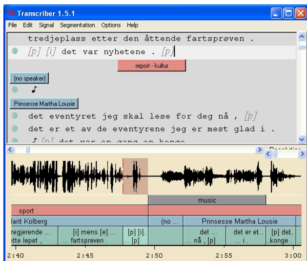
Figure 2 Screenshot from annotation using Transcriber