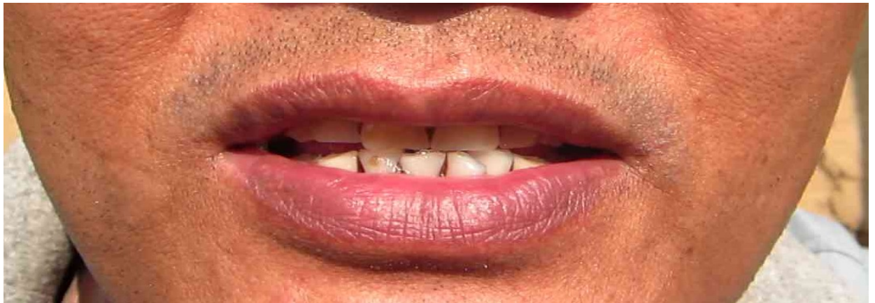
Photo No. 2. Released stage (teeth are still unseparated), with the air in lateral pathways