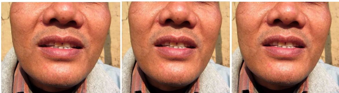
Stages in production 3.1