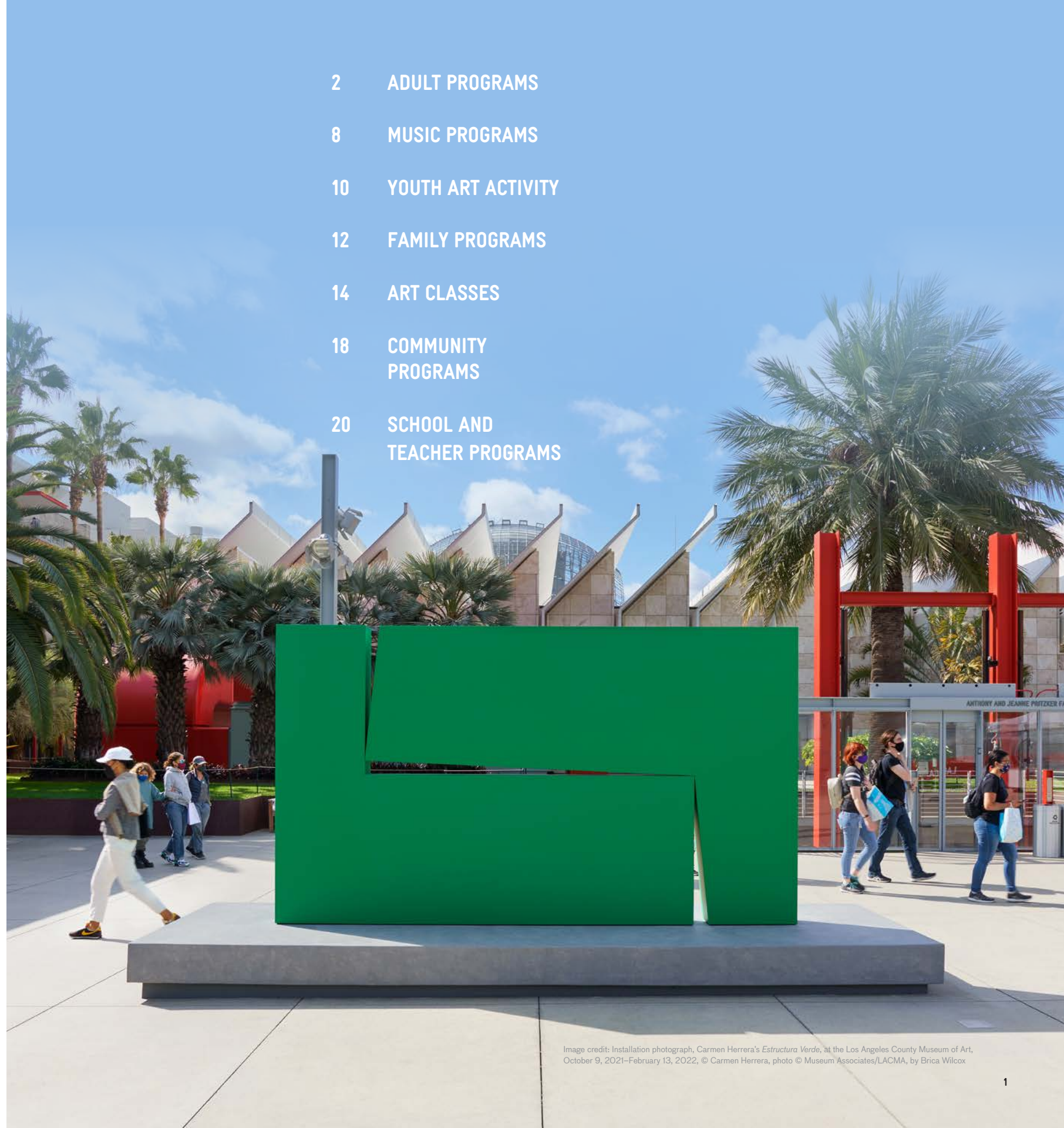
Installation photograph, Carmen Herrera's Estructura Verde , at the Los Angeles County Museum of Art, October 9, 2021–February 13, 2022, © Carmen Herrera