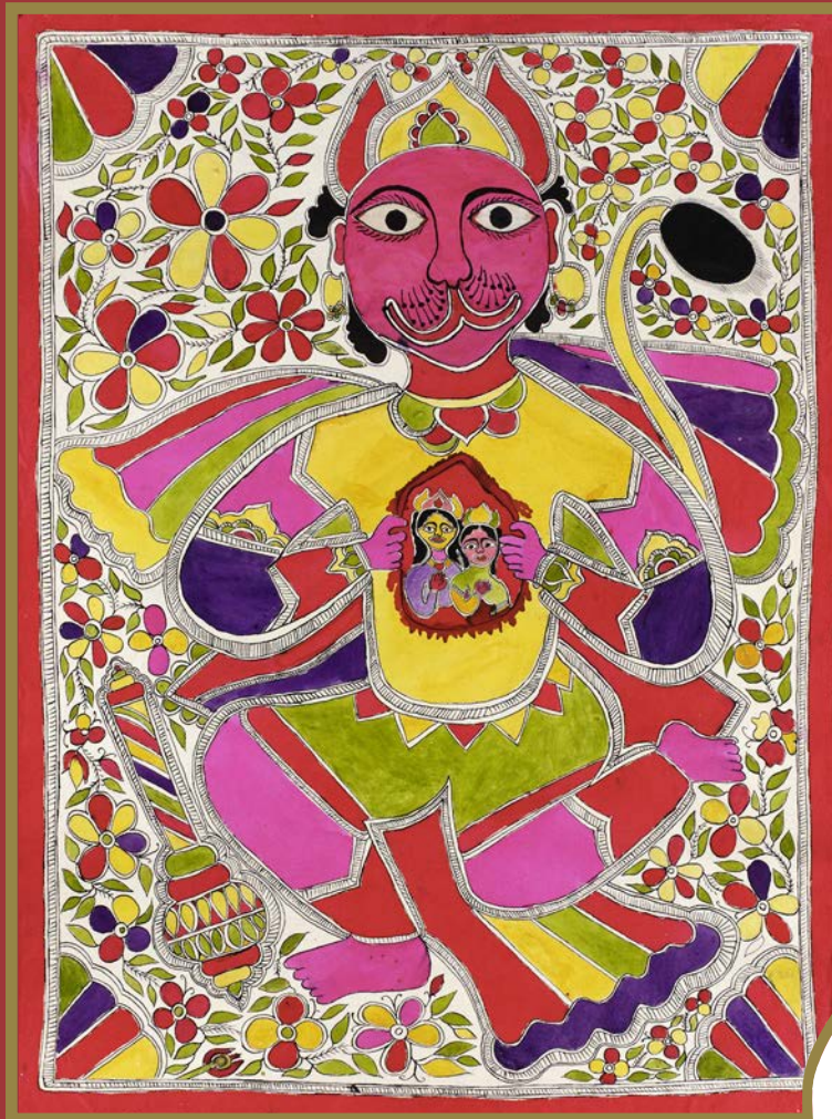
Image: Hanuman with Rama and Sita in His Heart, India, Bihar, Mithila, circa 1975