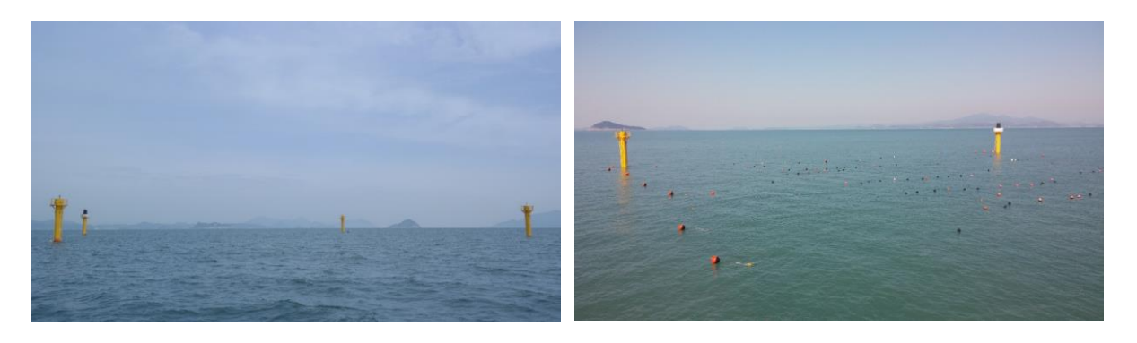
Fig. 3 Offshore macroalgae high-density production pilot system installed near Cheong-San-do island

The pilot system is now installed at open sea site near Cheong-San-do island, between Wando, Jeollanamdo and Jeju island. Fig. 3 shows the pilot system installed in open sea.