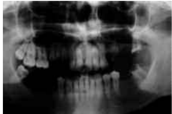
Figure 1. X-Ray showing the pre-operative condition of a patient enrolled in our study.

All the patients underwent a careful hematologic and cardiologic evaluation in specialist wards in order to optimize and customize the prophylaxis and the preoperative pharmacologic therapy. The bone loss was assessed by means of