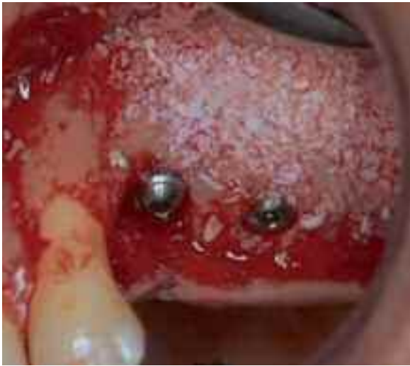
Figure 6. Bone window covered with filling material.