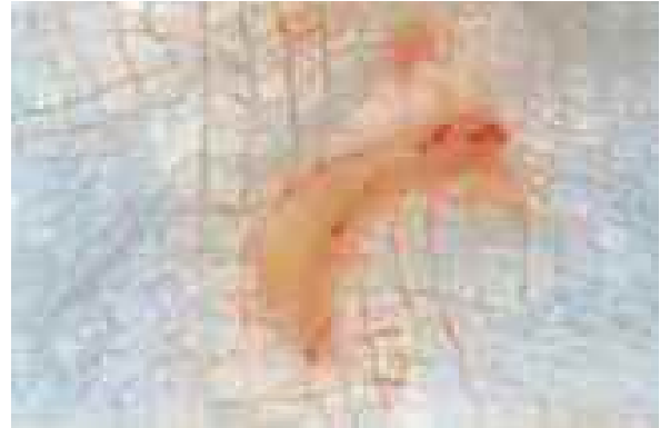
Figure 4. Platelet-Rich Fibrin in his membranous form.

As we selected cases in which the height of the residual bone was superior to 5 mm, we opted for surgical procedure of “ one-stage sinus lift ” (implant insertion occurred concurrently with si-