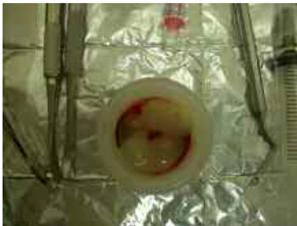
Figure 3. Sterile cup with Platelet-Rich Fibrin in his gelly form.

The treated patients were inserted in a follow-up program which included: