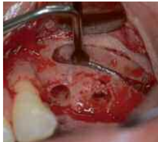
Figure 5. Vestibular osteotomy performed by piezosurgery.