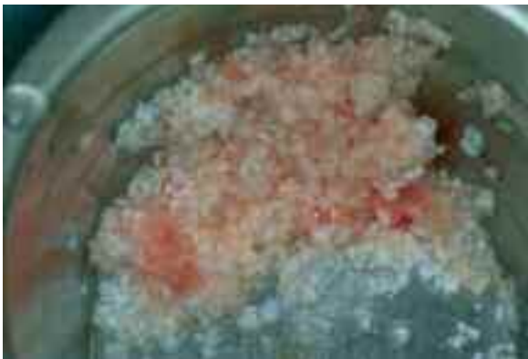
Figure 7. Sterile cup with Platelet-Rich Fibrin mixed with Bio-Oss®.

The present study involved 23 patients and 31 sinus lifts were performed, together with