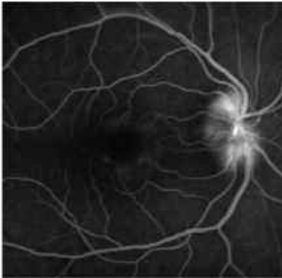
Figure 3. Papillitis (fluorescein angiography).

has been effective after failure of conventional immunosuppression since TNF- \alpha is a proinflammatory cytokine which has been implicated as an important mediator in autoimmune ocular inflammatory disease pathogenesis. This treatment is empirical and supported by small case series in the literature due to the relatively low prevalence of ocular manifestations in IBD.