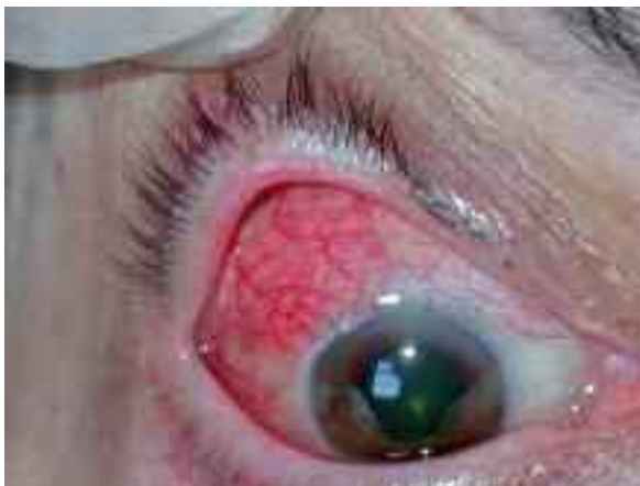
Figure 1. Episcleritis.

Retinal vasculitis can involve arterial or venous vessels with peri or endovasculitis. Periphlebitis is the most frequent manifestation. Vascular walls show diffuse or focal sheathing and infiltration. Vasculitis can induce vascular occlusion with following neovascularization and retinal hemorrhages. Fluorescein angiography is