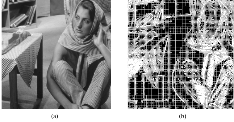
Figure 2 Quadtree Decomposition Result (a) Source Barbara image (b) Quadtree Decomposition result