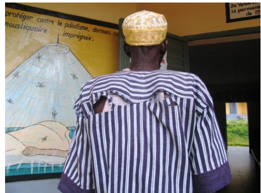
A traditional healer attended in the Health center of the Prefectural Health Directorate of Gueckedou after been beaten by villagers

The spectre of these intra and inter-community conflicts has on one hand affected the building of cohesion among community leaders and the public in the fight against EVD, and on the other hand, has made it difficult for the Ebola response teams to access in the villages to inform, educate and mobilize people. Some villages, accusing other villages of being "traitors and to have sold out", went as far as to prohibit Ebola response teams from using the roads that provide access to other villages affected by EVD and that sought help.