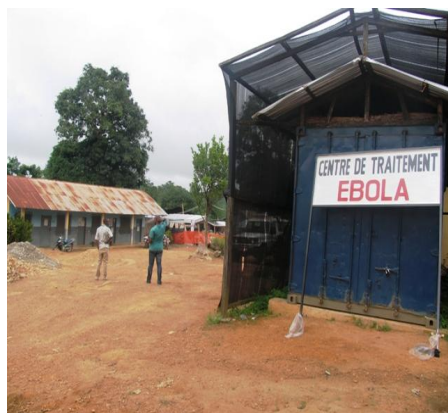
Ebola treatment centre in Guéckédou

MSF gave details on the operation of treatment centers, as well as all the humanitarian measures that were needed. For example, they encouraged families to bring patients meals made at home, and provided free transportation for families to visit the sick. They provided mobile phones to the patients to communicate frequently with their families, and confirmed that all the care received was for free, etc. With the aid of a drawing, MSF explained how viruses multiply very rapidly in the body, becoming stronger and more aggressive over the days. The longer that one remained in the house, the more the virus invades the body's defences, and the patient has less and less chance of the fight and to heal despite treatment at the Centres.