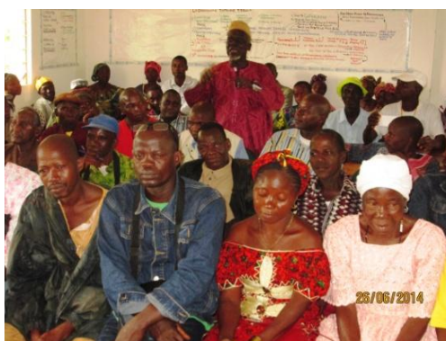
Head of sacred forest (only men)

The heads of sacred forests: they are the guardians of traditions and funeral rites. They say they have heard of EVD through the media, but were not involved to participate in the solution. "Our funeral rituals have always been respected, but with Ebola, there were problems. Despite a slight improvement, notably with the introduction of ritual objects and gifts in the body bag, we see that our own kind is disappearing. Our funeral rites are our identity and our pride. Now, if we are given the means, we will fight against Ebola"