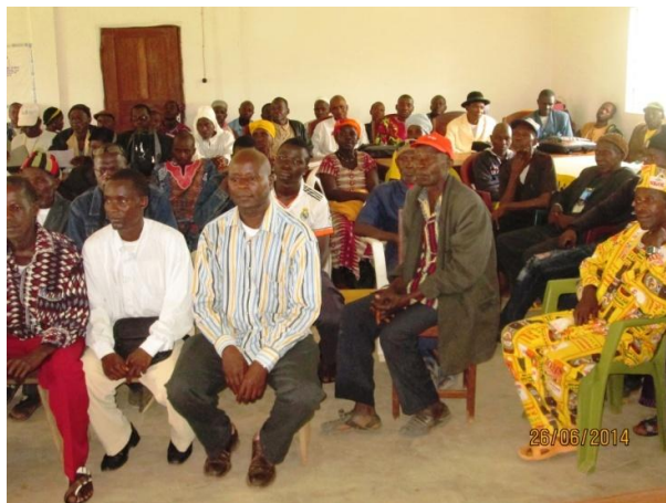
The religious authorities (Muslim and Christian)

neither vaccine nor treatment. Thus the people have preferred to die at home with their relatives instead of going to die in hospital. It makes sense. We will engage in the struggle. We must have the means."