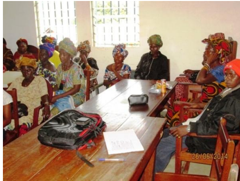
The traditional births attendants

Traditional births attendants: "We have learned of the existence of Ebola by rural radio and rumours. Had we been made aware, we would have participated in the struggle because the women in our villages listen to us. Now let's do it, and we need to be trained, to have new messages and prevention kits."