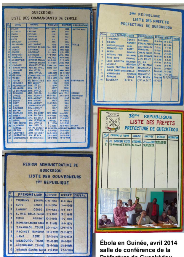
Les panneaux d'époque, disposés face au public, rappellent les noms des chefs de cercle, de gouverneurs et de préfets en exercice de 1908 à 2014. Ce respect de la mémoire d'un passé douloureux, notamment colonial, contraste avec la fréquence des rumeurs accusant les «Blancs» de complots, de volonté génocidaire et d'enrichissement. (photo Alain Epelboin)

Traditionally, the Kissi majority in Forest Guinea and the "Ebola Triangle" (Guinea, Liberia and Sierra Leone) have no leader. Their egalitarian and fragmented organization (in hamlets and villages) meant that they attached great prestige to the position of the Elder of the lineage (Paulme, 1960). The authority exercised by the chiefs (sector chiefs, district chiefs, sous-prefect, etc.) was only established in the colonial period in an effort to control and govern (Balandier 1955), and was perpetuated since independence by the administration and successive political powers. Analysing the names of the 69 directors of the region since 1904 that appear on the panels exposed in the meeting room of Gueckedou Prefecture shows from surnames, only 5 or 6 are originally from Forest Guinea (talking in the list of the prefects of the 2nd Republic Kamano, Milimonou, Beavogui, Balamou, etc.).