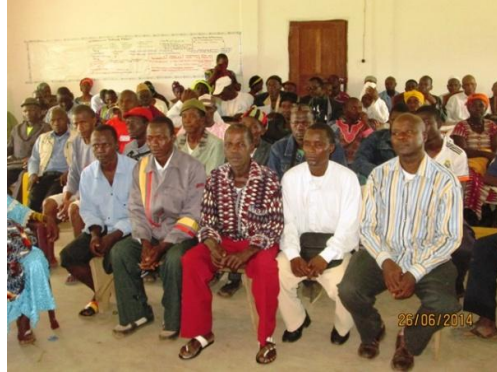
The youth organization

On June 18 th , officials who left Conakry to conduct health awareness of Guéckedou had been assaulted by the population. Wounded, they were repatriated to Conakry.