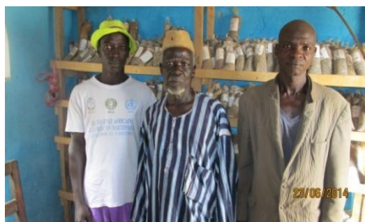
One the most influential traditional healer in his shop with his students

The heads of sacred forests: they are the guardians of traditions and funeral rites. They say they have heard of EVD through the media, but were not involved to participate in the solution. "Our funeral rituals have always been respected, but with Ebola, there were problems. Despite a slight improvement, notably with the introduction of ritual objects and gifts in the body bag, we see that our own kind is disappearing. Our funeral rites are our identity and our pride. Now, if we are given the means, we will fight against Ebola"