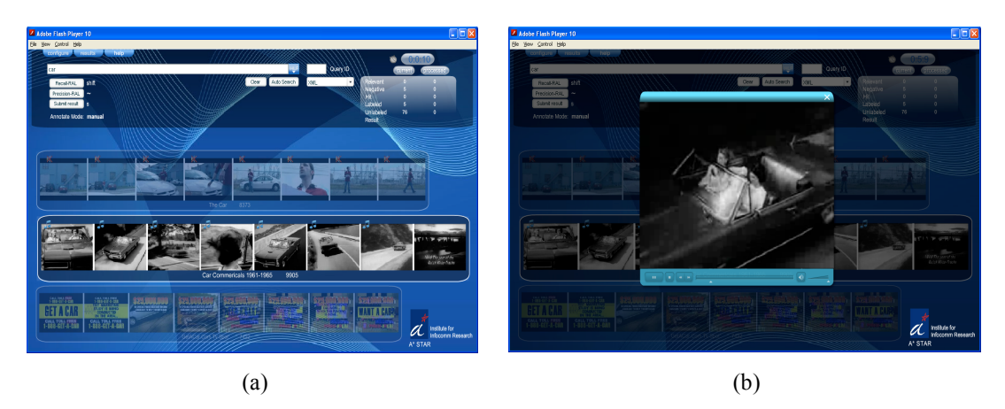
Figure 3. The user interface of interactive KIS system (a), and (b) shows the video play function of the UI.

Table 1: Present the results obtained from our system performed on the 122 and 300 queries respectively. Note that, the features HLF and Audio + LANG is not used on the 122 queries.