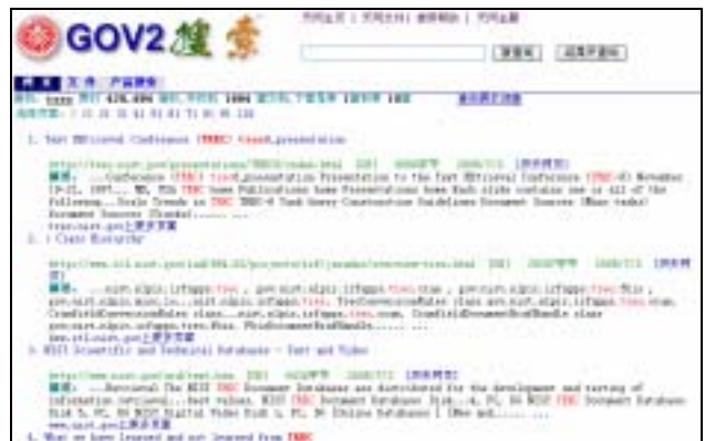
Figure 1. The GOV2 Search Engine

Actually we built a search engine based on the GOV2 data. Its searching results are shown on Figure 1.