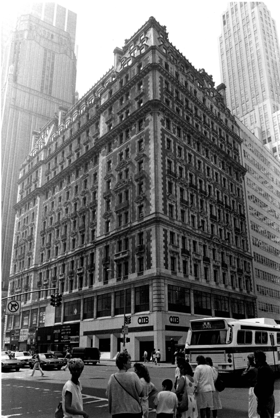
Knickerbocker Hotel 1462-1470 Broadway