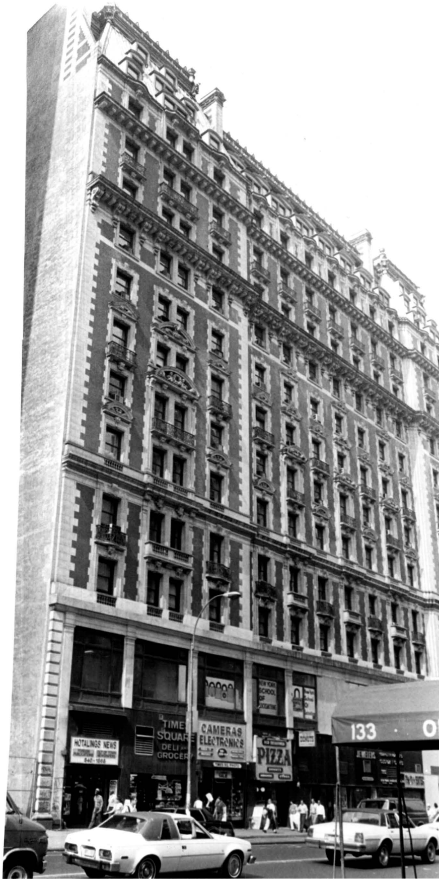
Knickerbocker Hotel Facade, West 42nd Street