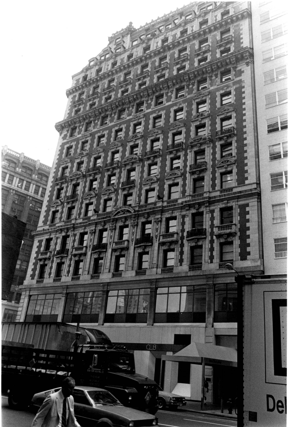
Knickerbocker Hotel Facade, Broadway