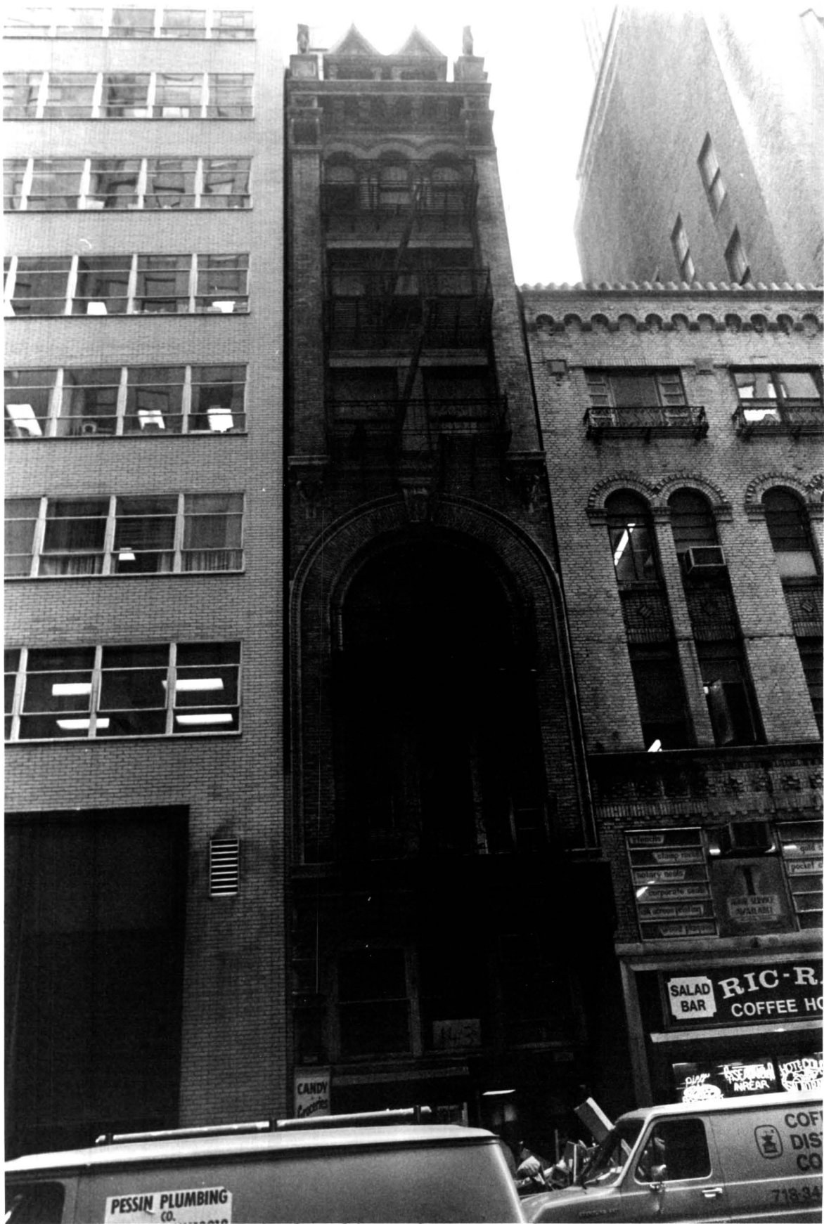
Annex, Knickerbocker Hotel 143 West 41st Street