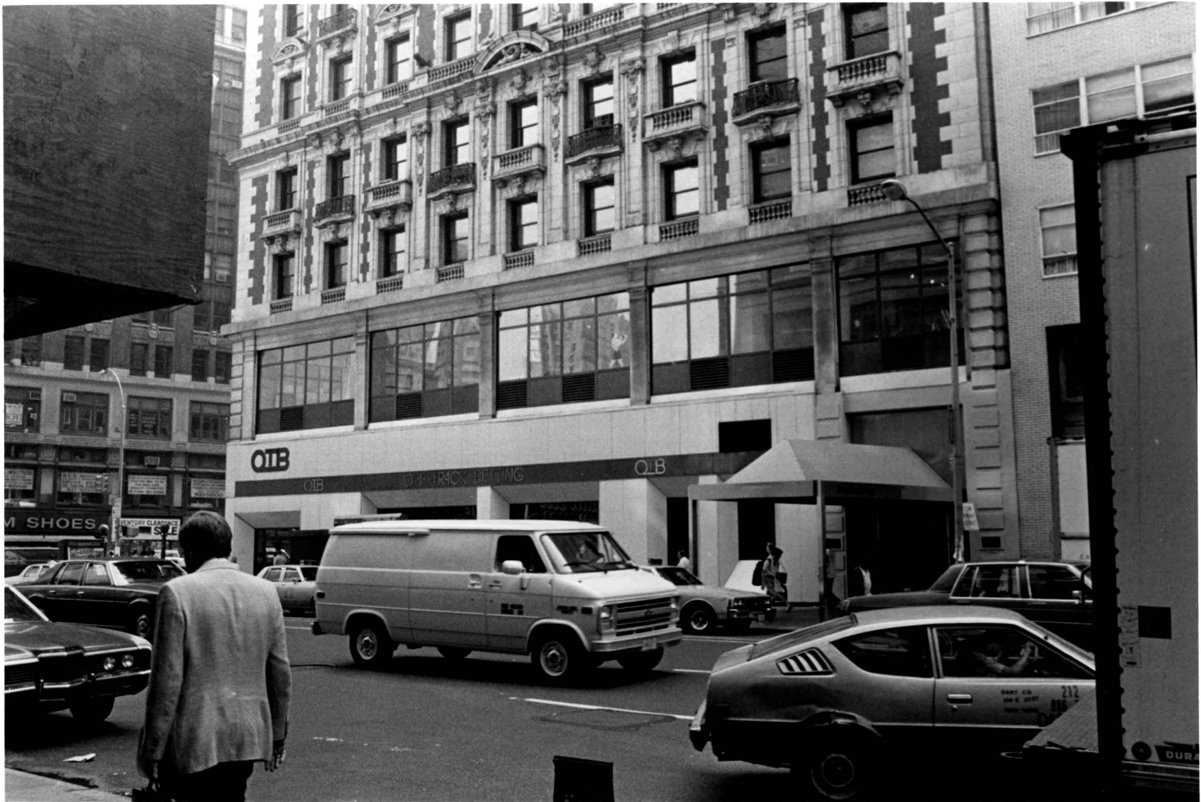
Knickerbocker Hotel Broadway Facade, entrance