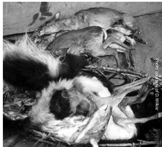
Small ungulates – one day catch – Congo