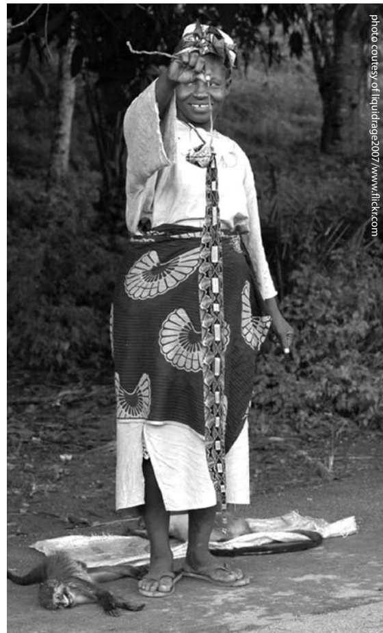
Bushmeat vendor in Cameroon