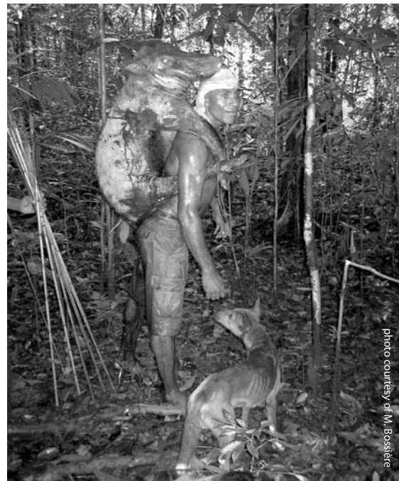
Papuan hunter with wild pig