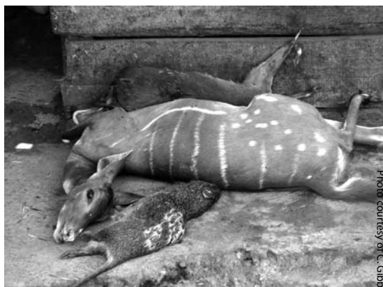
Antelope and Grasscutter in Ghana