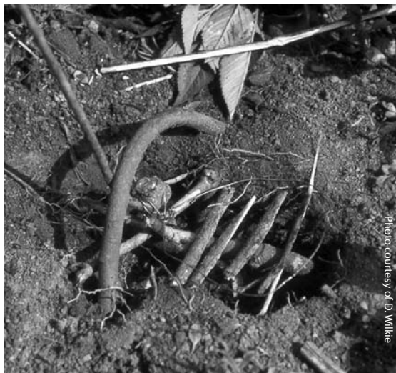
Snare used for trapping

Hunting rules and regulations exist almost everywhere but they are rarely enforced. There is clearly an ownership and management problem. The State is the owner of the resource and issues rules and regulation to manage it but the State is unable to enforce its decisions. A law that is not enforced undermines the authority of the government, and a law that can only be enforced at great cost and difficulty might need to be revised. There is much work to be done in order to tackle this issue in most tropical countries. The range States 6 and their donors need to take a radical look at all types of natural resource policies with the clear aim of enhancing the rights and sustainable livelihoods of rural dwellers. In Asia, the example of Sarawak (Malaysia) gives some cause for optimism. A Master Plan for Wildlife in Sarawak has been developed based on long-term research and has resulted in the passing and strict enforcement of a new law banning all trade in wild animals and their parts, strict control of shotgun