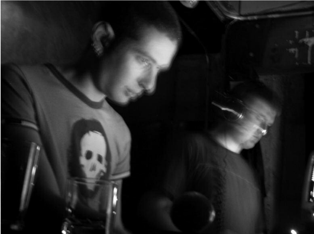
Figure 1: “The gesture is embedded in the music”[10] (Blue Vitriol [3], (c) Patina Mendez; Hazard County Girls, (c) Larry Stern)

Performers of live computer music generally stare at the screen intently while performing, rather than interacting with the audience. What the performer is staring at is obviously important, judging by the intensity of the stare. However, what the performer is looking at is out of view for the audience. This is in stark contrast to traditional musical instruments, where the instrument is generally in plain view, and the audience is familiar with the mechanisms of that instrument. The absence of these two qualities further alienates the performer from the audience. This alienation can be alleviated when the musician can perform using an expanded range of gestures. The performer can come out from behind the computer screen, bringing back a closer connection between audience and performer. Michel Waisvisz’s “The Hands” is a great example of such an interface. Built in the early eighties, it has been used to control a variety of different sound synthesis schemes. It is a novel interface that he has played for 20 years, achieving virtuosity. It allows him to stand on stage with nothing but “The Hands” and use gestures large and small to control sound and compose in realtime.