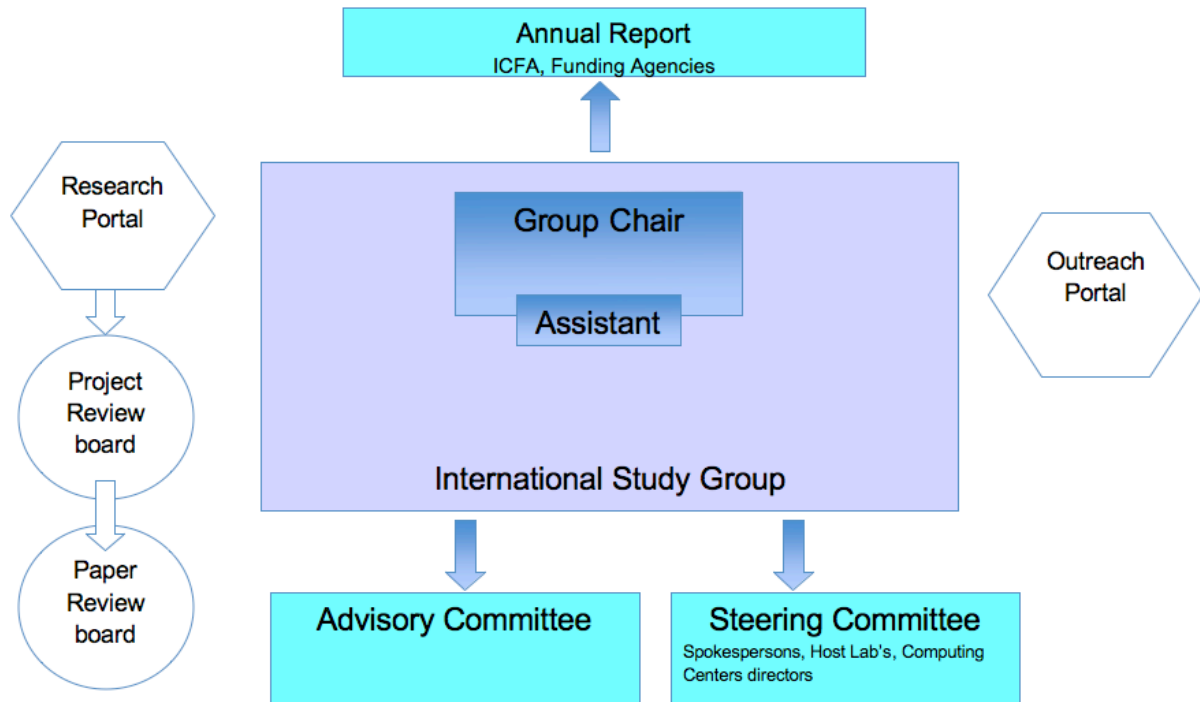
Figure 2: Organisation of an international forum for data preservation in high-energy physics. The group is structured around a chair and his assistant, in charge with the communication with the steering and advisory committees and with ICFA. This lightweight structure is already informally in place. The research and the outreach portals are possible longer term extensions of the present activities.