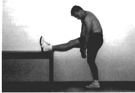
FIGURE 3. Head/chin toward knee hamstring stretching technique.