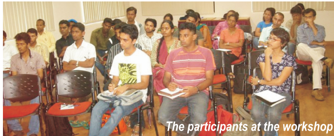
The participants at the workshop