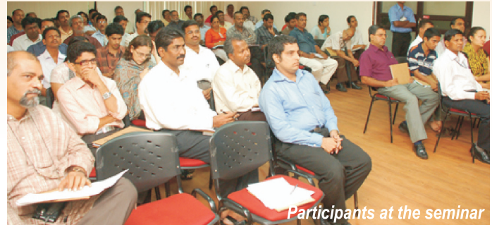
Participants at the seminar