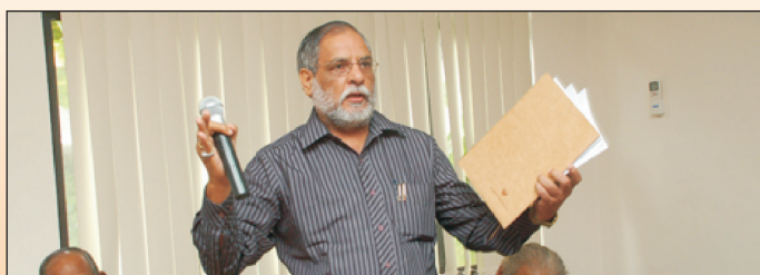
Participants giving their views

‘A proposed amendment to the coastal regulations zone (CRZ) by Union Ministry of Environment and Forests has raised suspicions of being misused by commercial lobbies though it is purportedly aimed at protecting structures of traditional fishermen’, experts spoke at a day long seminar on ‘CRZ – 2010 Draft: Responses & Challenges’, held on 8th September at ICG and organised by The International Centre Goa,