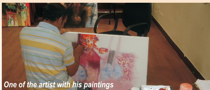
One of the artist with his paintings