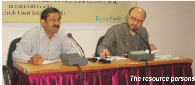
The resource persons