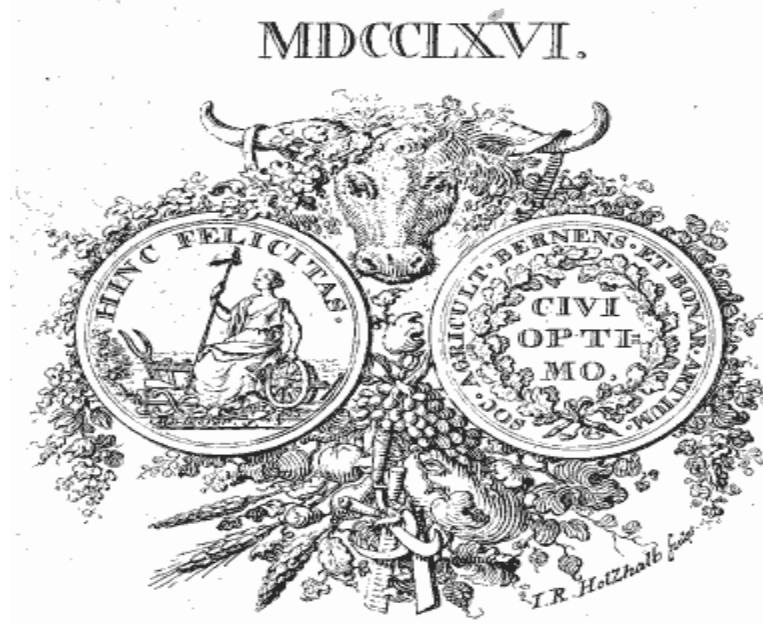
IMAGE 4 AGRICULTURAL EMBLEM OF THE SWISS ECONOMIC SOCIETY, BERN (1766) 113

knowledge. I cannot reveal to you what I am expecting, what I am hoping for in this deepest of moments. But do not despise the discoveries of the people who preceded you in this noble cause. " 114