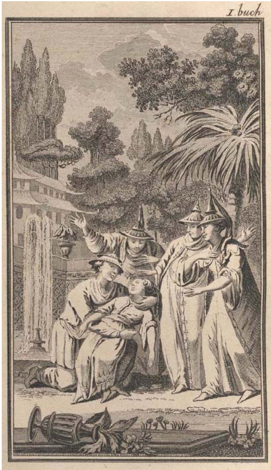
IMAGE 5 A CHINESE SCENE FROM ALBRECHT VON HALLER'S USONG (1771) 130