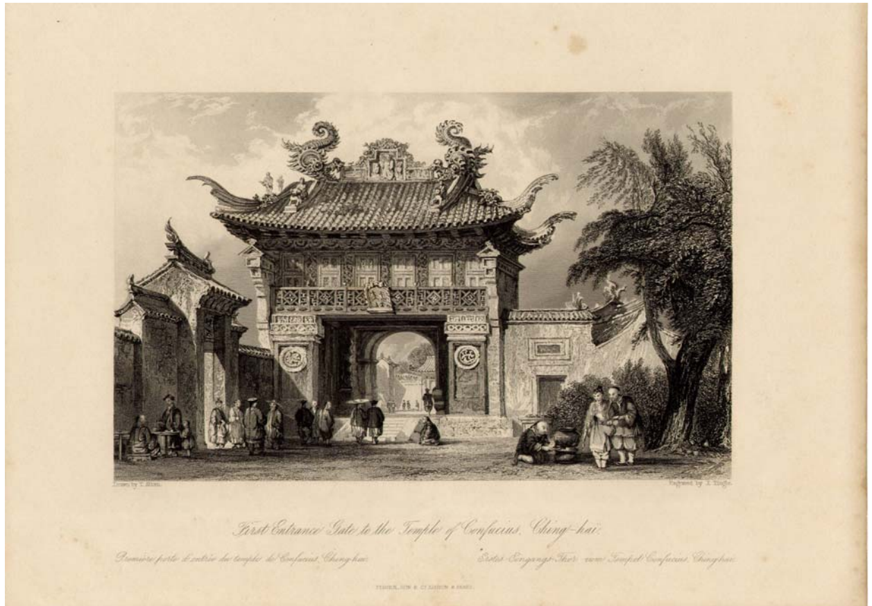
IMAGE 6 EFFECTS OF CHINA'S CRAFTSMANSHIP. PROSPEROUS CHINA AS SEEN BY 19 TH CENTURY EUROPEANS. 138

FIRST ENTRANCE, GATE TO THE TEMPLE OF CONFUCIUS, CHING-HAI, BY J. TINGLE, DRAWN BY T. ALLOM, 1843