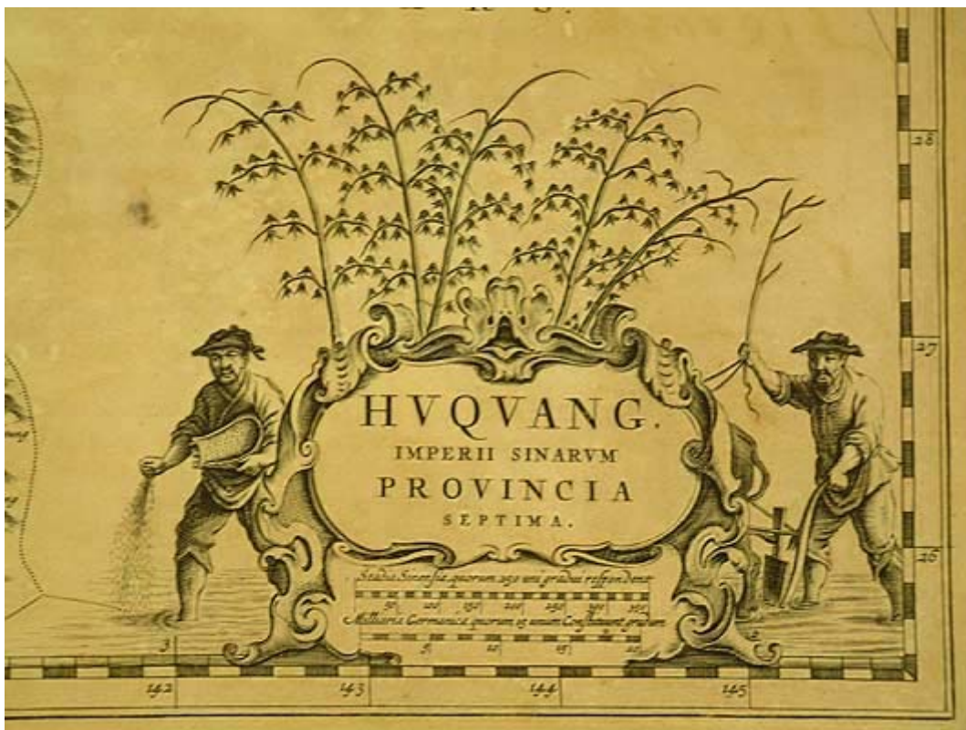
IMAGE 1 CHINESE RICE PEASANTS "LETTING THE PLANTS GROW". DETAIL OF A MAP FROM MARTINI'S "NOVUS ATLAS SINENSIS" (1655) 36

Amsterdam): the first scientific atlas of China, compiled by Martino Martini in 1655 (see image 1), and Athanasius Kircher's China monumentis: qua sacris qua profanis (...) illustrata published in 1667. 34 These two publications from Amsterdam showed in detail the territorial magnificence and economic wealth of the Empire, influencing Leibniz, Quesnay and others, in the years to come. 35