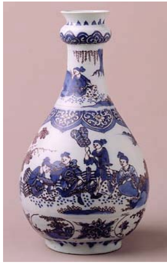
IMAGE 2 SCENES OF MINBEN ON ART FROM DELFT (1678- 1686). 47

can be traced back to this massive influx of Chinese porcelain. By 1650, ten pottery workshops had opened at Grotius's birthplace alone – there would be thirty in 1670. 45 The makers of Delft's faïence copied various Chinese images displaying picturesque and joyful scenes of minben (see image 2). By 1700, millions of pieces of faïence, depicting the comfort and welfare of the wu-wei Empire, had diffused throughout Europe. 46