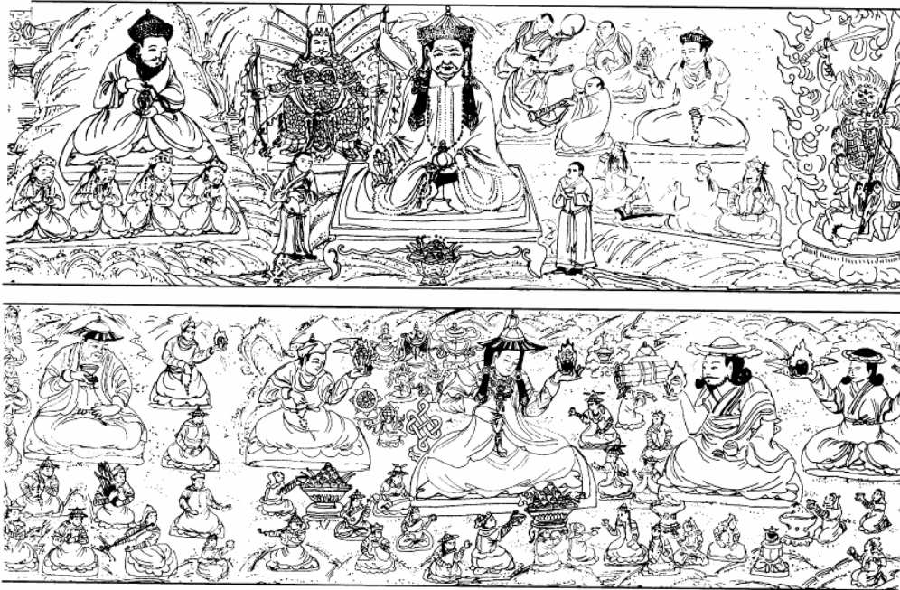
Fig. 7. Mural painting representing Buddhist lay donors and monks of Altan Qan's family, main temple of Mayidari-yin Juu, lower part of the western wall of the back shrine, H. 2m, L. 16m long, 17 th century (drawing by Wang Leiyi, in Jin Shen 1980: 176).

Temples preserving two-dimensional portraits of Mongol qan are known after the fall of the Yuan dynasty. The fortified Mayidari monastery (Mayidari-yin Juu, Ch. Meidai zhao 美岱召), 70km west of Hohhot (Kökeqota), preserves in the rear part of its main temple a large 17 th century mural painting 49 of donors where the Chinggisid nobility is represented below a 7-meter high painting of Tsongkhapa (Charleux 1999) ( fig. 7 ). The painting represents the two princesses who patronized this monastery – one of the oldest of the Buddhist revival: on the right side on Tsongkhapa's throne, Jönggen Qatun (known in Chinese as Sanniangzi), Altan Qan's famous Third wife (ca. 1550-1612) faces her third husband Cürüke, who bends towards her in a respectful attitude ( fig. 8A, 8B ). 50 On the other side of the painting, the princess Maciy Qatun (ca. 1546-1625) faces the Mayidari Qutuγtu (1592-1635), a Tibetan reincarnation recognized as an emanation of Maitreya and sent to Hohhot in 1604. Fifty-eight laymen and monks of much smaller size, turned towards the central characters, most of them sitting in padmāsana in a worshipping attitude and two divinities complete the scene. The painting is laden with Buddhist symbols such as piles of jewels, the Eight auspicious symbols, etc.