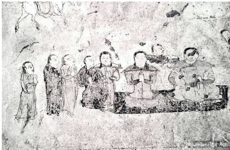
Fig. 11. Painting of donors, south wall, lower register, left to the entrance, cave n°31 at Arjai (Otoy banner, Ordos). Batu Jirigala and Yang Haiying 2005: 147.

In cave 31 dedicated to Śākyamuni, also probably dated from the Northern Yuan or Qing dynasty, monks (some wearing Gelugpa hats) and laymen are depicted under a painting of Vaiśravaṇa located on the south wall to the left of the door ( fig. 11 ). They also figure as Buddhist donors but here are represented in a narrative context.