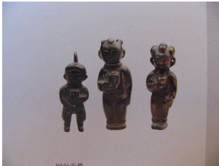
Fig. 3. Three ongons , bronze (5cm, 4,8cm and 4,3cm) excavated in Tongliao Municipality, Mongol Empire, Inner Mongolia ( Nei Menggu bowuyuan and Zhonghua shijitan yishuguan (eds) 2004: 310-311).

The Mongols used to feed their ongons by smearing their mouth and sometimes the whole face with fat and cooked meat before each meal, by sprinkling, and fumigation. 17 In exchange, the spirit was thought to commit itself to respecting a contract, whereby he would protect the household or clan and the sheep and cattle, bestow prosperity, prevent sickness, and ensure success in hunting, otherwise he could expect reprisals. An important feature in the definition of an ongon is the food that maintains a spirit into the support: the spirit remains within it as long as it is fed. As Roberte Hamayon (1990: 404) noted for 19 th century Buryats, 'c'est la nourriture qui maintient un esprit dans son support et [...] un esprit a besoin de son support pour être nourri; base du traitement rituel des ongon , elle est leur principal sinon unique élément commun fondamental, car varient formes et matières, procédés de genèse et de fabrication, modalités de culte et d'appartenance, esprits hébergés (animaux ou humains) [...].' Human spirits that could dwell in an ongon were either angry and potentially dangerous human spirits, or great ancestors. 18 The stone human statues and the effigies of Chinggis Khan, being material supports allowing the dead to be fed, can therefore be included in the large category of ongons . The stone statues holding a cup can be compared to small bronze ongons dating from the Mongol Empire holding a cup in their hand ( fig. 3 ).