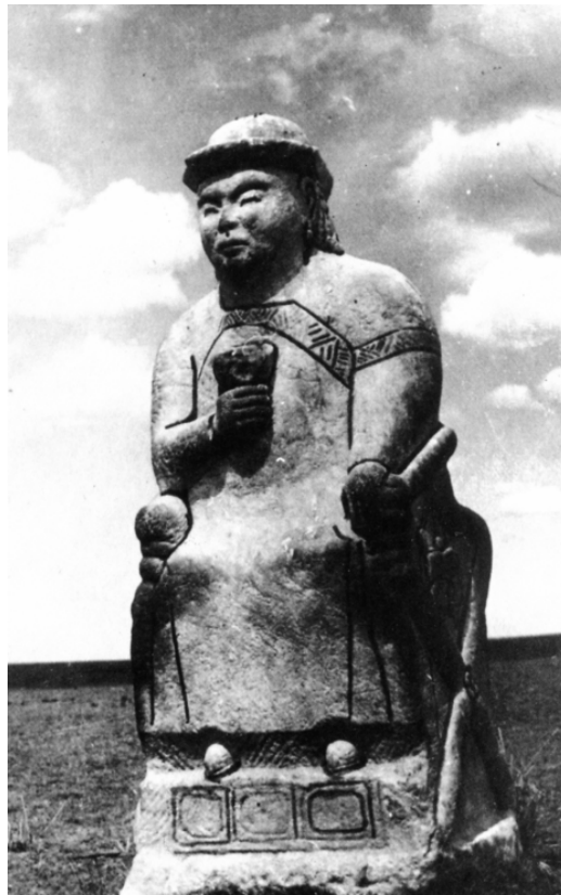
Fig. 1. Stone marble statue, 13 th century, Sühbaatar province, Dariganga sum. Tsultem 1989: n°56.

rosary in their left hand, others hold the cup with both hands. Their face generally looks towards the southeast. Their clothes and hats are comparable to those of Yuan tomb mural paintings' figures such as that of Yuanbaoshan 元寶山 (fig. 18), to real robes and hats found in tombs, and also fit with the section on costume in the official Yuan History : 6 male robes fastened to the right, sleeves tight-fitting at the wrist, belt from which are suspended personal accessories, boots, caps or turbans. 7 The majority of them are sitting on a folding chair ( jiaoyi 交椅) with a round back, armrests, and feet-support.