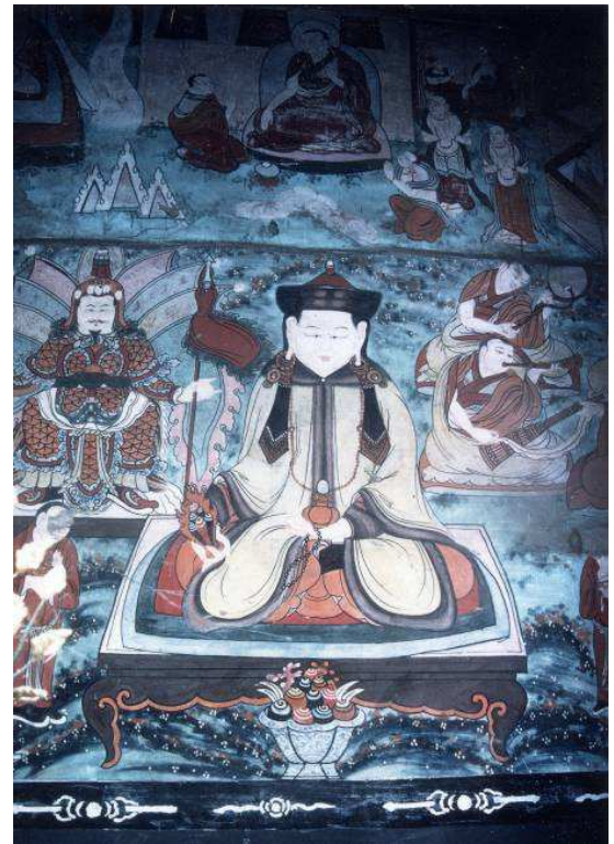
Fig. 8A. Cürüke (Altan Qan's grandson and Jönggen Qatun third husband), detail of the right part of the donors' painting (see fig. 7). © Jin Shen