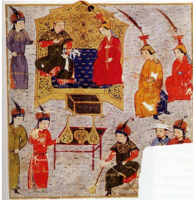
Fig. 16. Tolui and his court, Jami 'al-tavarikh , 14 th century, by Rashīd ad-Dīn, Ms Sup persan 1113, folio 164v, Bnf, Paris.

In Qing dynasty Mongol paintings of the universal monarch ( cakravartin )'s Seven Jewels, the queen and the minister are depicted on an equal footing, on the right and left (or left and right) of the wish granting jewel and the cakra , a disposition which is not seen in Tibetan painting. 64 Even when the universal monarch himself is not depicted, the symmetrical arrangement of the queen and the minister is an obvious reference to the enthroned royal couple.