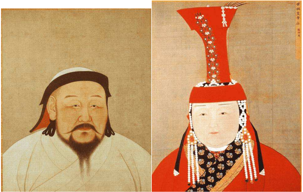
Fig. 4A. Portrait of Qubilai Qan (Shizu 世祖), album leaf, ink and color on silk, 59,4x47cm, China, Yuan dynasty, from Yuandai di banshen xiang 元代帝半身像, Collection of the National Palace Museum, Taipei. Fig. 4B. Portrait of Cabui, album leaf, ink and color on silk, 61,5x48cm, China, Yuan dynasty, from Yuandai dihou banshen xiang 元代帝后半身像, Collection of the National Palace Museum, Taipei.

If the general stylistic models for the portraits are obviously the earlier Chinese imperial portraits kept in the imperial collections and highly valued by the Yuan emperors, technical and stylistic features such as the method of describing highlights on the jewels of the portrait of Cabui (d. 1281) ( fig. 4B ), and the thick coat of painting, show an Himalayan influence. 41 The album portraits of later emperors have been done by Chinese artists of the imperial workshops such as Li Xiaoyan 李肖岩 (for the faces) and lesser craftsmen (for the hats, hair and robes) in 1332 in a similar style. The costumes, hats and the hair braided into a few loops hanging behind the ears are all characteristic of Mongol portraiture. 42