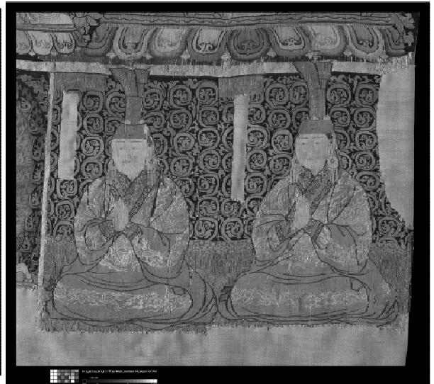
Fig. 6A. Detail: two emperors, TuγTemür and his elder brother Qosila , on the lower left of the thangka...