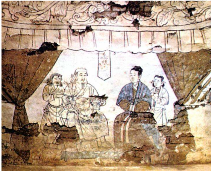
Fig. 17. Portrait of the tomb couple on the north wall, Pucheng tomb, Donger village, Pucheng district, Shaanxi province, northeast of Xi'an, 1269 (Liu Hengwu 2000; Shaanxi sheng kaogu yanjiusuo 2000)

couples, or Mongols who chose to be depicted in the Chinese fashion, with Chinese furniture and vessels. The other elements in these portraits, such as the architectures, screens, back curtain, and tables rendering the domestic atmosphere, are not seen in sovereign's ancestors' statues and paintings, and are proper to the genre of Chinese tomb paintings. They show that the tomb occupants have a comfortable life, surrounded by servitors. 66