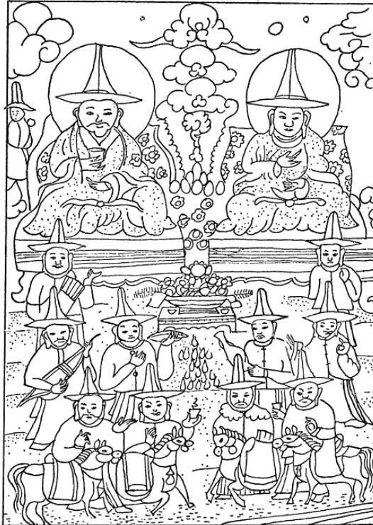
Fig. 14. Sacrificial image, representing Chinggis Khan, his main consort and his sons. Copy of a 'Yuan dynasty painting' preserved in the 'mausoleum of Chinggis Khan,' Ejen Qoriya banner, Ordos (probably Qing dynasty). Drawing from Heissig 1973 [1970]: 421, fig. 11 (from Dylykov, S. D., Edzen-choro , Moscow: Filologija i istorija mongol'skich narodov , 1959; see a reproduction in Solongγod 1999: fig. 13). The cup of the qatun has been omitted in the drawing but is present on the painting