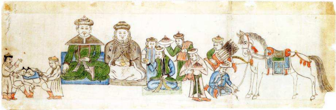
Fig. 9. Paintings representing Abatai Qan and his family, copy by Dendev of a mural painting (not preserved) of Erdeni Juu, H. 150cm, L. 100cm, Zanabazar Fine Arts Museum, Ulaanbaatar

A second example is a series of three paintings of Abatai Qan (1554-1588), the Tüsiyetü Qan of the Qalqa, and his family decorating a wall at Erdeni Juu monastery (in present-day Mongolia). They are known from copies made by the painter Dendev in 1950: the originals have not been preserved and I do not know their former localisation in the monastery. The Tüsiyetü Qan is depicted sitting cross-legged on a cushion or carpet, in a frontal position, alone or with his wife, and receiving the homage of monks and laymen (fig. 9).