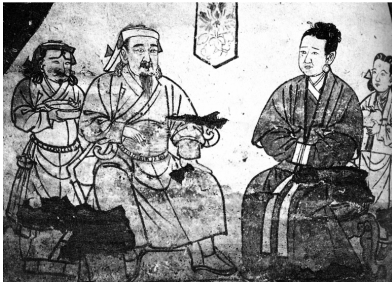
Fig. 18. Painting of the tomb occupants, detail, Yuanbaoshan tomb, north wall (width 2,43m, height 0,94m), Chifeng municipality. From Xiang Chunsong, 1983, color pl. 1.