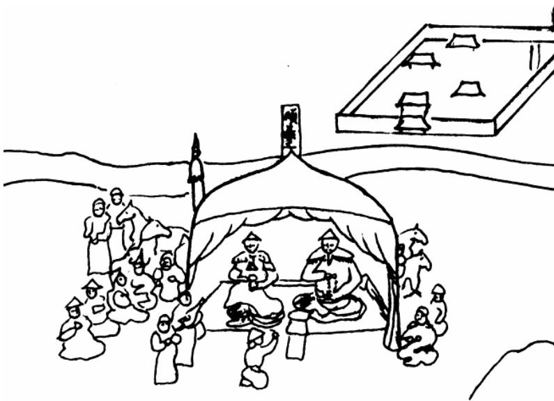
Fig. 19. Altan Qan and his wife, drawing of the painting which accompanied a letter written on a horizontal scroll, dated August 17, 1580, addressed to the Ming emperor. Institute of Eastern studies, attached to the Russian Academy of Sciences, St. Petersburg (from Pozdneev, 1895).

The reverse, seen in two tomb murals (Beiyukou and Sanyanjing), seems to be an 'anomaly,' probably a Chinese influence. In a unique political document dated 1580 depicting Altan Qan and his wife, the qatun sits on the qan 's right ( fig. 19 ). 67 In this case, the switched position might have been intended to fit with Chinese customs, and to please the Ming emperor to whom it was destined. Or else, the letter was rewritten and redrawn by the Ming officials in order to present a formatted document to satisfy the requirements of the Ming court, a usual practice for this kind of document. Except for this detail, the representation of the qan and his wife remarkably fits with the Mongol conventions: they sit cross-legged under a yurt, holding rosaries, and receive offerings from kneeling courtiers and servants. The qatun , probably Jönggen Qatun, is slightly smaller than Altan Qan.