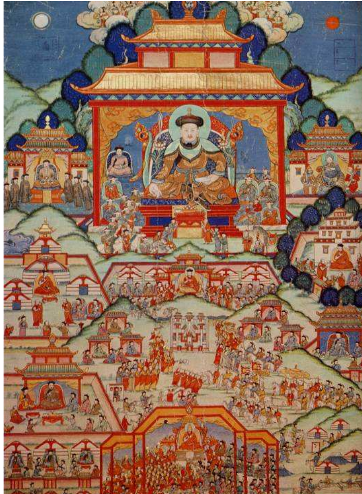
Fig. 12. Abatai Qan, cloth thangka, unknown painter, 62x86cm, Qing dynasty, Central Museum, Ulaanbaatar (Tsultem 1986: fig. 152).

same old man with a staff who seems to be pushed and helped by other attendants and try to present a cup on the left. But here, Abatai has a vajra -topped hat and holds lotuses carrying a sword and a vajra : the king is depicted alone, without his wife, with the attributes of a bodhisattva. His position, palace and courtiers mirror that of the king of Shambhala in 19 th century thangkas.