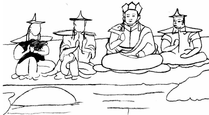
Fig. 10. Drawing of the painting of donors, detail, south wall, lower register (120x50cm), right to the entrance, cave n°28 at Arjai (Otoy banner, Ordos). © Isabelle Charleux

In cave 28, a painting (120x50cm) allegedly representing Chinggis Khan's family caused much ink to flow ( fig. 10 ). A procession of a hundred people worship eight persons sitting on a large white platform under a dark tent or an architectural monument, in front of a table covered with offerings. Although there is no inscription, the archaeologists believe that the painting of cave 28 is a Yuan dynasty 'imperial portraiture' ( yurong ) for the sacrificial rites, and agree to identify the main characters as Chinggis Khan, surrounded by his main wife Börte Üjin (on his right) and his other two wives Qulan and Yisügen (on his left); farther on his left would be sitting his four sons (Joci, Cayadai, Ögedei, and Tolui); and the worshipping figure sitting below on the left and leading people offering camels and horses would be his fourth wife, Yisüi. 53