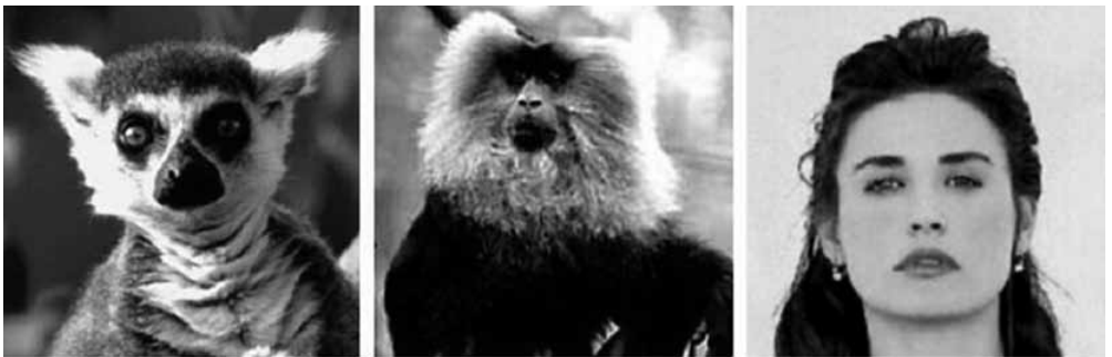
Figure 1. Overall, humans have relatively little facial hair as compared to other primates; the conspicuous presence of the hair forming the eyebrows is somewhat intriguing. A number of selection pressures may be responsible for the development and persistence of the eyebrows over the course of primate and especially human evolution. A color version of this figure can be seen at http://www.perceptionweb.com/misc/p5027/ .

Evolutionary history has seen a considerable reduction in the amount of hair on the human face (McNeill 2000; figure 1). As such, the presence of the eyebrow might seem a curiosity. Do the eyebrows in fact serve a useful purpose or are they merely an evolutionary vestige? While it is perhaps true that eyebrows may provide the eyes modest protection against such things as rain and perspiration, it is perhaps more relevant that the eyebrows also appear to serve a number of functions that are more visual in nature. Eyebrows may serve as high-contrast lines that give the appearance of the brow greater clarity and emphasis, and their associated musculature allows for sophisticated, often involuntary gestures that may be discerned from a relatively large distance. As such, the eyebrows appear to play an important role in the expression of emotions and in the production of other social signals, and they may also contribute to the sexual dimorphism