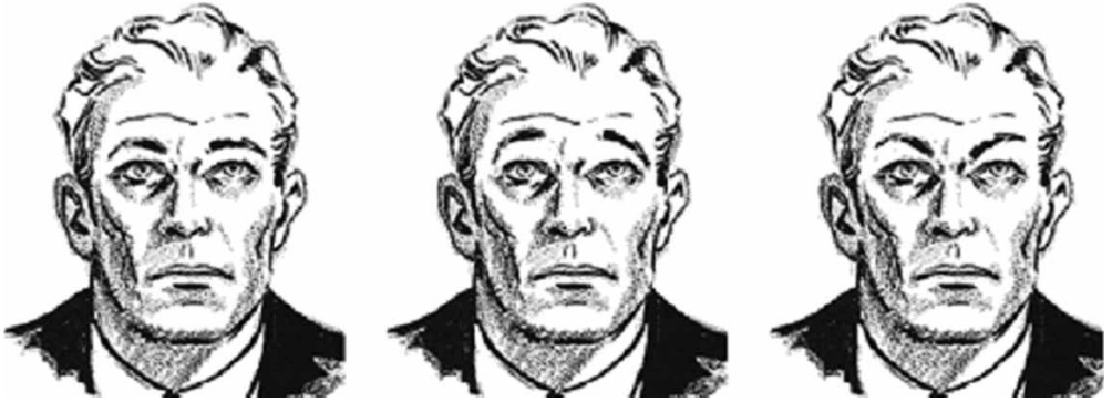
Figure 2. These cartoon faces are identical except for their eyebrows. Alone, or in concert with other facial movements, changes in the angle, height, and curvature of the eyebrows can drastically alter the emotional expression of a face and may play an integral role in nonverbal communication.

power of the eyebrows to convey emotions in even the simplest of line drawings. An illustration of this is depicted in figure 2, in which the three faces are identical except for the angle and height of their eyebrows. It can be seen that the movement of the eyebrows alone may be enough to greatly alter the emotional expression of a face.