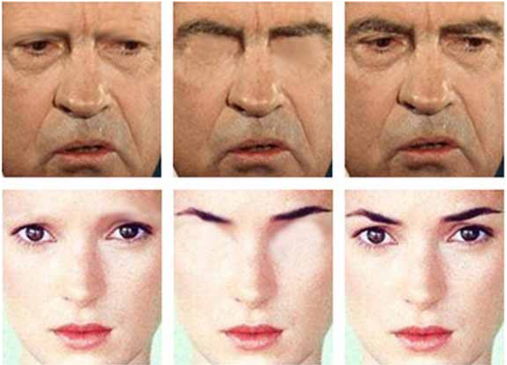
Figure 4. Sample stimuli from our experiment assessing the contribution of eyebrows to face recognition: original images of President Richard M Nixon and actor Winona Ryder, along with modified versions lacking either eyebrows or eyes.

the introduction of any concomitant artifacts (eg any changes in the color, shading, or shape of the brow ridge inconsistent with the original image). When such an artifact could be observed in a stimulus, whether at the normal scale or higher magnification, the relevant portion of the image was redone.