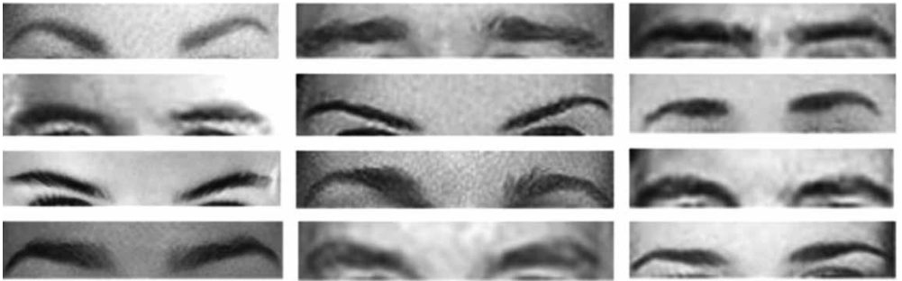
Figure 3. Considering the great diversity in the appearance of eyebrows across individuals, one may expect the eyebrows to constitute an informative attribute for the task of face recognition. Our experiment was designed to assess whether the human visual system does in fact rely on the appearance of eyebrows in order to identify people. A color version of this figure can be seen at http://www.perceptionweb.com/misc/p5027/ .

Bruce et al 1999). In contrast, familiar faces appear to be better identified from internal features and may be more appropriate stimuli for assessing the role of eyebrows and other features in face recognition (Ellis et al 1979; Young et al 1985). As such, the stimuli chosen for the current study were images of famous faces. Further, we sought not only to investigate the involvement of eyebrows in the recognition of these famous faces, but also to compare any such contribution to that of their most favored neighbors, the eyes. The goal of our experiment was to address this issue directly, by determining whether and to what extent the absence of eyebrows might reduce the ability of individuals to recognize otherwise familiar faces, and by quantitatively relating any such effect to the corresponding detrimental effect that might result from the absence of eyes. Of course, it may be worth noting that memory-based face recognition, the focus of the current study, might rely on processes different from those involved in, for example, match-to-sample comparisons or subjective judgments of facial appearance of similarity, even for the same set of stimuli.