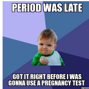
Figure 8 – Success Kid

Staredad seeks to shock – it is not the unlikely (and therefore comical, if we were to understand this example in terms of incongruous humour) situation of a young boy being pregnant that is the source of humour, rather it is the sincere presentation of a reference to self-induced abortion. This, Hermione’s shock, and Success Kid’s celebration all work to construct pregnancy as risky and burdensome, derogating mothers and motherhood, limiting the range of ‘acceptable’ identities able to be claimed in this media and space.