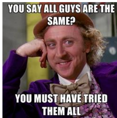
Figure 11 – Condescending Wonka

Looking at the Actual Advice Mallard macro, we can see that it typically serves as an ‘advice’ meme, offering useful tips and tricks as seen on the left of Figure 12 ("Actual Advice Mallard | KYM," n.d.). However, as we see on the right of Figure 12, Actual Advice Mallard is being used to perpetuate what Hawthorne and Klein (1999,