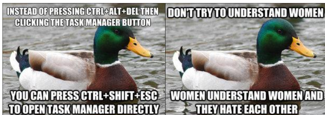
Figure 12 – Actual Advice Mallard

p.5) described as the “patriarchal ideology of women as enemies”, but within online space. Hawthorne and Klein (1999, p.5) understand connectivity to be “at the heart of feminism”, thus we can understand this troubling construction of women who ‘hate’ each other as a discursive strategy which seeks to undermine attempts at cyberfeminism. In addition, the production of the feminine as mysterious and unknowable via a ‘fact/advice format’, drawing upon early psychoanalytic discourse (Gough, 2004) justifies essentialised gendered relations, the lack of interest of feminine sexuality and separatist gendered politics.