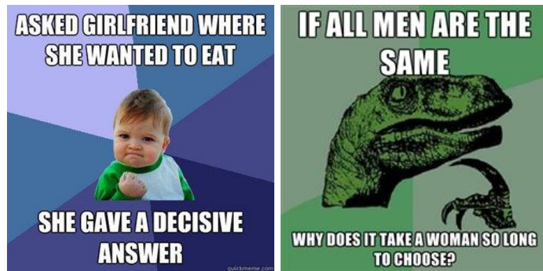
Figure 9 – Success Kid; Figure 10 - Philosoraptor