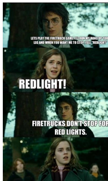
Figure 26 – Horny Harry

Another Horny Harry meme (Figure 26) shows an interaction between Harry Potter and Hermione Granger, where Harry suggests that he and Hermione play “the firetruck” game – he will run his hand up her leg, and when she feels uncomfortable and wants him to stop she can yell “redlight”. In the second frame Hermione calls redlight, yet Harry reminds her that “firetrucks don’t stop for red lights”.