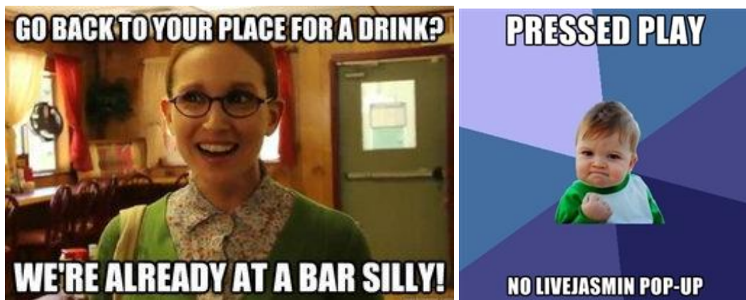
Figure 4 – Sexually Oblivious Female; Figure 5 – Success Kid

Interestingly, women were not only presented as sexually passive, but also as sexually ‘oblivious’. Memes such as the Sexually Oblivious Female (Figure 4) and Oblivious Suburban Mom (Figure 1, previously) present women as naïve, misunderstanding the intentions of other people and being unfamiliar with online technologies and spaces (“Sexually Oblivious Female | KYM,” n.d.). Through the juxtaposed presentation of women as technologically naive and men as technologically privileged, online spaces and technologies are coded as masculine, and the spaces claimed through the deployment of meme humour.