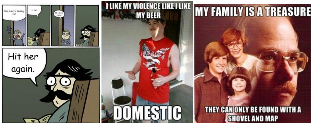
Figure 22 – Staredad; Figure 23 – Redneck Randal; Figure 24 – Vengeance Dad

In addition to this, some of the sampled memes suggest that sexual violence and abuse in particular are comical subject matter. Memes such as Insanity Wolf, an Advice Animal format meme featuring a snarling wolf on a black background offer particularly violent and extreme captions covering rape and molestation ("Insanity Wolf | KYM," n.d.). The images in Figure 25 demonstrate this.