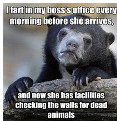
Figure 21 – Confession Bear

This humour portrays senior or powerful roles in work spaces as something undesirable or unsuitable for women. Combined with the “get back in the kitchen” and “make me a sandwich” refrains discussed previously, we suggest that these memes