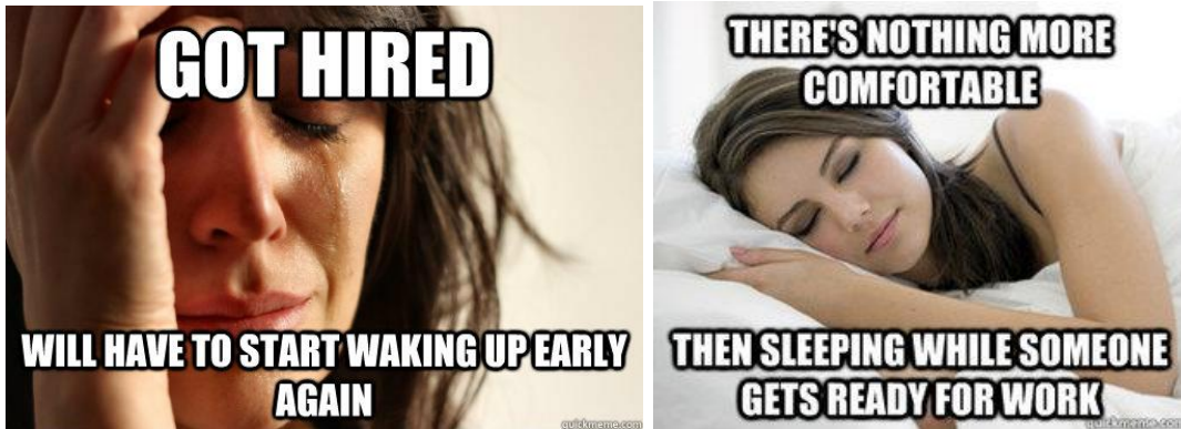
Figure 19 – First World Problems; Figure 20 – Sleeping In

presentation, where the active construction of a woman in management is derogated and disrespected, presumably by a male subordinate.