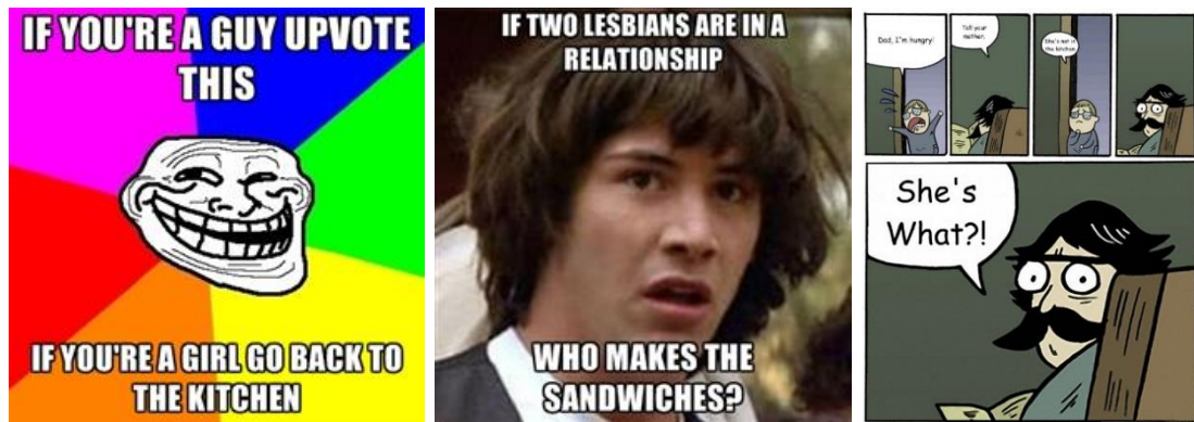
Figure 16 – Trollface; Figure 17 – Conspiracy Keanu; Figure 18 - Stareddad

Moreover, issues of work and material wealth cropped up in image macros featuring and discussing women. Women are shown complaining about waking up for work, or sleeping while someone else gets ready for work (see Figures 19 and 20), implying that they are happy to be taken care of financially (presumably by a male partner). There is a contradiction here for the status positioning of the domesticised woman, with the construction of domestic spaces as the appropriate place for women, while women are simultaneously criticised for being dependent on a male breadwinner, thereby reiterating the costly positioning of women within the ‘breadwinner’ discourse that earlier feminist work theorises (e.g. Hollway, 1984b). In a Confession Bear meme (Figure 21), a female boss is tormented by an employee on a daily basis, demonstrating a lack of respect paired with toilet humour. This is a particularly interesting