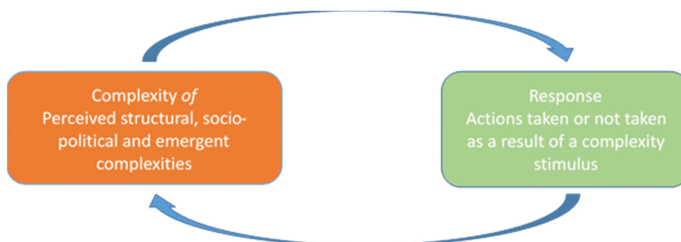
Figure 3: Duality of complexity and response

The relationship between complexity and response then is recursive and we propose conceptualising it as a duality – where the response is simultaneously enabled and constrained by the perceived complexity and vice versa (see Figure 3). A duality is an appropriate conception as opposed to a dualism – there is not complexity or response – both are ongoing, co-exist and interact. The nature of such interactions in dualities have provided rich research fields for Social Practice scholars (from Giddens (1984) to more recently Feldman and Pentland (2003)). The concept of response is expanded to include 'actions not taken'. This may echo the findings of Kutsch and Hall (2009) in risk management where legitimate responses to risk included delay, denial and avoidance of the risk stimulus.