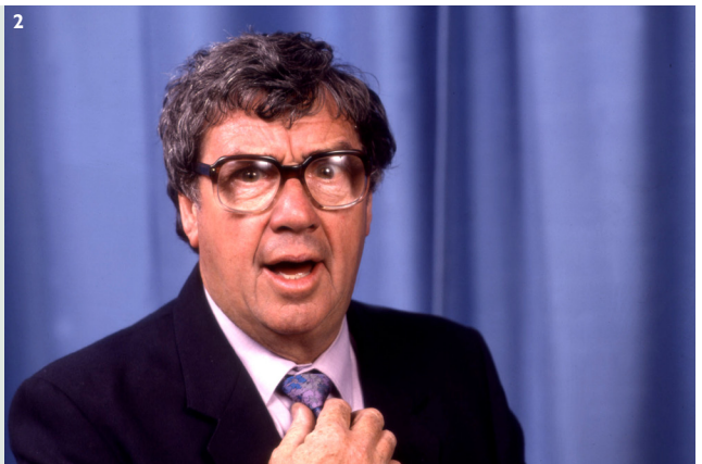
2. Celebrating a comedy genius – Frank Carson.