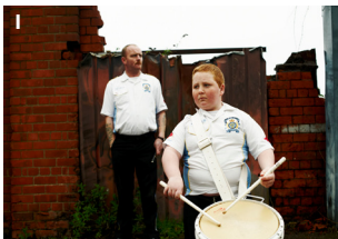
1. The Men Who Won't Stop Marching.

We also worked with Creative Skillset and industry colleagues to deliver the Belfast Media Festival (which this year included a speech by BBC Director General, Mark Thompson) and played a key role in the creation of a new trainee scheme, Aim High . It provides placement and training opportunities for emerging production talent and attracted over 1,000 applications. The first cohort of trainees are now working with BBCNI and are actively involved in all aspects of the production process – learning the skills that will help them to secure the BBC's programme-making future in an increasingly digital world.