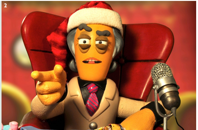
2. Unique talent – Gerry Anderson's animated look-alike in On the Air .