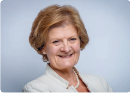
Dame Fiona Reynolds DBE Senior Independent Director. Appointed January 2012. Chairman of the Remuneration Committee, Fair Trading Committee, and Nominations Committee for non-executive appointments. Master of Emmanuel College, Cambridge.