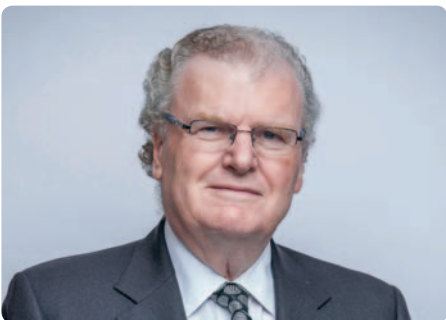
Sir Howard Stringer Appointed January 2014. Non-executive director of Talk Talk Group.

This is the membership of the Executive Board as at April 2014. Throughout the reporting year membership has changed. Please refer to p102 for further details.