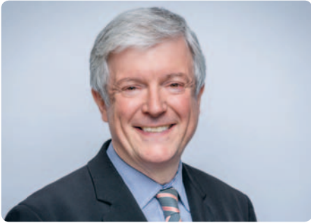
Tony Hall, Lord Hall of Birkenhead, CBE Director-General since April 2013.