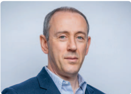
Sir Nicholas Hytner Appointed April 2014. Director of the National Theatre and Trustee of the Royal Opera House.