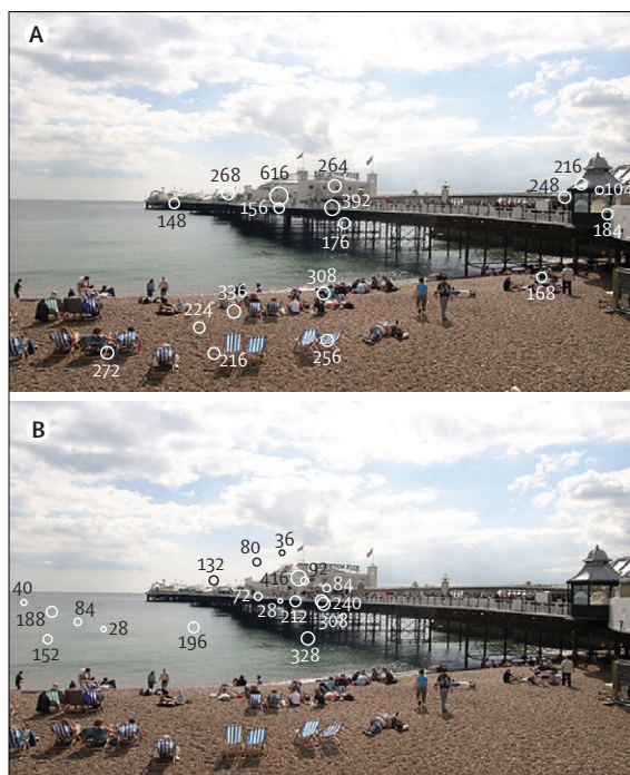
Figure 1: Visual dysfunction in posterior cortical atrophy

Should PCA be deemed a unitary clinicoanatomical syndrome or, rather, a collection of related but distinct syndromic subtypes? By extrapolation from basic neuroscientific evidence of distinct cortical streams that process different types of visual information, 41,42 researchers have suggested that separate parietal (dorsal), occipitotemporal (ventral), and primary visual (striate cortex, caudal) forms of PCA exist. 12,13 However, these claims are based on findings from individual case reports. Subsequent studies of neuropsychological case series have failed to provide evidence to support a pure ventral-stream syndrome 19 and, rather, have indicated considerable overlap in neuropsychological profiles and patterns of cortical thinning in patients with behaviourally defined predominantly dorsal-stream or ventral-stream