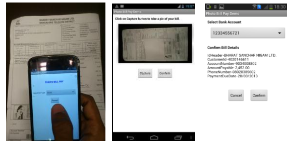
Figure 3 System design for the proposed solution

Initial prototype of bill image data processing system on Android platform containing three screens is shown in figure 3. First image in figure 3 (from left-right) shows screen 1 of the MA which is used for capturing image of a bill. Second image illustrates screen 2 which provides an option to the user to accept or reject the image. Screen 3 in the third image shows results of the structured Key-Value pairs returned by IRE.