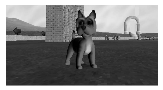
Figure 1: Duncan the Highland Terrier

But more importantly, the architecture needed to facilitate the construction and control of synthetic creatures. Intelligence is often seen as the confluent effect of many individually unintelligent components (as in [Minsky 1985]) and the architecture needed not only to support those components individually but also to allow them to coexist