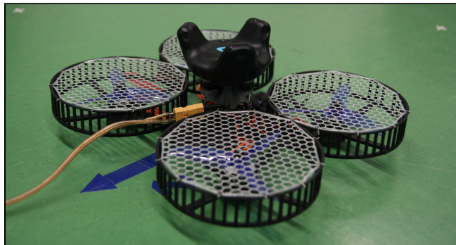
Figure 1: Custom drone build from of the shelf components. A mounted HTC Vive tracker enables low-cost tracking. We 3D-printed a rotor case for direct human-drone interaction.

LMU Munich, Munich, Germany {firstname.lastname}@ifi.lmu.de