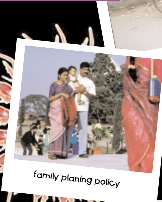
family planing policy