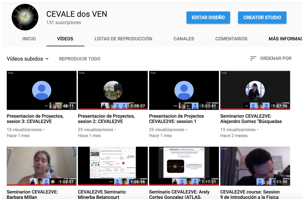
Figure 2: The CEVALE2VE YouTube channel [6], which contains more than 100 hours of online audio-visual content and 9000 views and dozens of comments in the tutorials.

2016. Five Colombian and Venezuelan universities were visited alongside a substantial outreach program to inspire and engage physics students with cutting-edge research using data from the ATLAS experiment at CERN, and motivate them to continue their studies in a period of 2 weeks in October 2016.