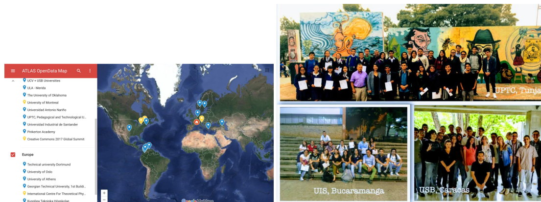
Figure 3: Google maps image showing location/users of the ATLAS Open Data educational platform [11] (left) and images from the Colombian and Venezuelan undergraduate and masters students who followed a one day master class in October 2016 [8, 9, 10]

in Colombia and Venezuela. We included it in the data analysis module of the third edition of the online course “Introduction to Particle Physics” that took place between March and July 2017. It was motivating for the students to have access to real data, since most of the participating institutions are not involved in LHC experiments. Also, the first master thesis using the ATLAS Open Data was finished this year. The student was part of our first session of the course in 2014-2015 at the UCV university and worked on the evaluation of Dark Matter production in association with quarks or electroweak bosons in colliders like the LHC. The fact that the final dataset fits onto a typical USB key (under 11 GB), easing storage issues, is important for us because the IT infrastructure in some places in Latin America can be fragile and restrictive.