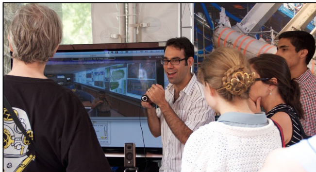
Figure 1. Virtual Visit from Science Festival participants in New York City to the ATLAS Experiment at CERN.

The CMS Experiment made important headway in communications in 2011 by implementing a Google Hangout [14] from the CMS cavern. Much like Virtual Visits, Hangouts provide direct video connections for discussion and also provide one-directional video and recordings embedded in the experiment’s YouTube