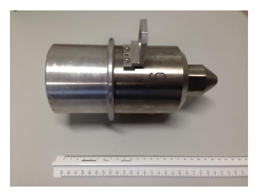
Figure 4: The figure shows the external container of a spare Antiproton Decelerator production target. The outer shell is made by Ti-6Al-4V alloy, while the inner core is composed by graphite with an iridium core.

Both of them will also undergo X-ray imaging, to understand the complementarity of the methods. We will also consider the possibility to insert bismuth \gamma -filters to understand the role of background photons in the imaging system.