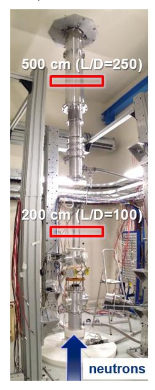
Figure 1: The photo shows a photo of the n_TOF EAR2, with the two possible location of the imaging detector and the L/D characteristics.

This Letter of Intent assumes no modifications of the n_TOF vertical beam line, in particular would keep the present collimator with a D=2 cm diameter at its end. As presented in Figure 1, two detector stations could be foreseen at various heights, at 200 cm (where no modification of the present detector system would be needed) and at 500 cm (on top of the EAR2 hall, which would require the temporary removal of the upper vacuum pipes up to the last flange before the beam dump). In the first case the imaging system would yield an L/D of 100, while for the latter the L/D would be 250.