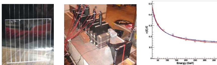
Figs 2: (L) A quartz plate coated with pTP, readout by parallel WLS fibers; ZnO:Ga filmed quartz or BaF 2 plates to be similar. (M) A photograph of the CERN 10 λ Fe Test Beam Calorimeter with pTP 2 μm film coated Quartz Plates; a Dual Readout BaF 2 scintillator/Quartz Plate Calorimeter would be similar. (R) \sigma E/E vs E for a quartz/pTP test calorimeter 10 λ x 1 λ wide.

The readout of these new tiles would use multiple parallel WLS fibers (similar to the figure above), coupled at the edge of the tiles to larger diameter quartz-cladded with plastic fibers (10% loss at 1 Gigarad). The readout would be modified so that the multiple straight-through WLS fibers are designed with mechanics which allow just the WLS fibers be easily replaced by removal of the WLS coupled to clear fibers, at periodic downtimes, similarly in concepts to the mechanisms that allow radiosource wires to be inserted and removed.