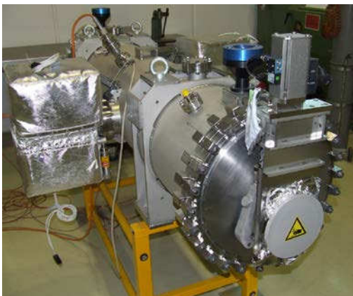
Figure 2: New distributor ready for installation.

In the injection line notably the system employed to split up the incoming beam into the planes of the four Booster rings is being rebuilt. This system consists of the distributor, a system of five pulsed magnets, which give an initial deflection to the beam slices destined to the different rings, followed by a vertical septum, which further increases the deflection angle. Both devices will be replaced by new ones that can operate at 160 MeV beam energy. The hardware is presently under construction at CERN. Figure 2 shows the new distributor ready for installation.