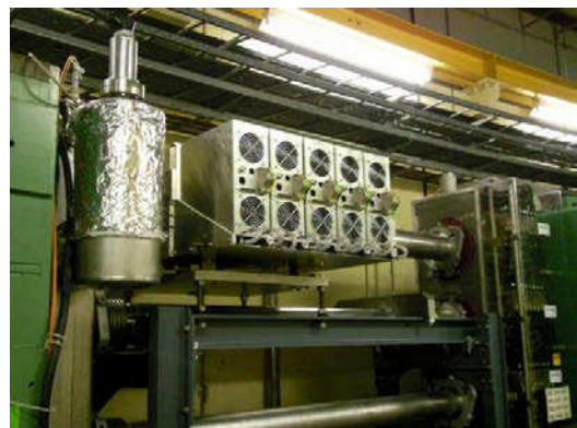
Figure 1: Prototype wideband cavity cells installed in Ring 4 of the PSB.