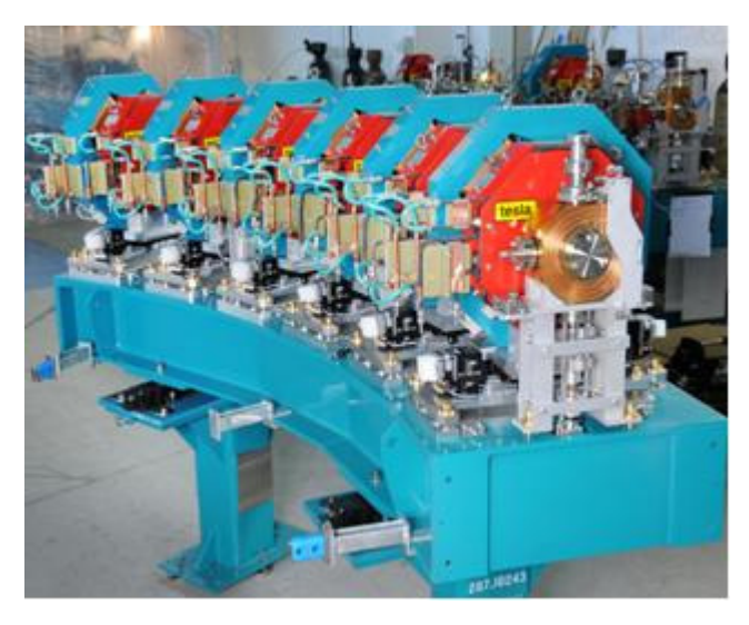
Figure 2: An EMMA girder, with 6 doublet cells mounted. The larger of the magnets is the D and the smaller is the F. RF cavities are mounted in almost every other cell and one can be seen at the end of the girder.

However, to maintain the symmetry of the ring and minimise the effects from resonances, clamp plates are mounted on all the doublets.