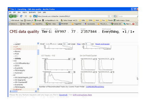
Figure 2: A screenshot from a typical view in DQM Graphical User Interface (GUI). Here the distributions for number of tracks and number of recorded hits per track (with two different reconstruction algorithms) are displayed.