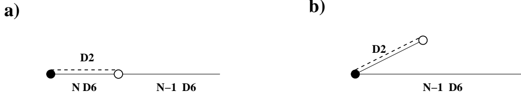
Figure 3: D-brane realization of the N_f = N_c - 1 SQCD theory in a geometry of the kind in Appendix A. The construction shows that instanton on its BPS locus (a) and away from it (b). The gauge D-branes cannot all recombine and define a non-supersymmetric background for the instanton.

In the regime of small misalignment, one can use the gauge theory viewpoint, where it is described as turning on a FI term. Being a D-term, this should not change the 4d superpotential. Thus it suggests that a non-BPS instanton induces a superpotential, seemingly in contradiction with our general picture, and with the counting of fermion zero modes from goldstinos. There is however no contradiction, as is manifest using the brane picture. In misaligning the instanton by moving the white degeneration up, as in Figure 3b, the gauge D-branes cannot all recombine and one of the color brane misaligns (this is visible in the field theory description as an uncancelled 4d D-term). Thus away from the instanton BPS locus, there is really no supersymmetry in the background, and therefore no need for the instanton to have four goldstinos. Indeed, the modes \bar{\tau}' are lifted by couplings with the bosonic zero modes between the instanton and the misaligned color D-brane. The instanton has only two (accidental) zero modes, the \theta' , and in the near BPS regime it induces operators which can be described in the field theory approximation as a superpotential (in a theory with D-term supersymmetry breaking).