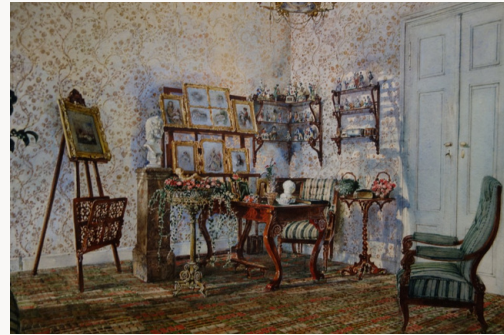
Fig. 7, Detail of Rudolf von Alt, Salon in the Rasumofsky Palace , 1836. [view image & full caption]

On the adjacent wall hung three equally charming exterior views of the palace and grounds by Joseph Höger (1801–77): the neo-classical building set in an English-style garden, a vista from its terrace, and another from a garden pavilion (fig. 8). The prince appointed Höger as drawing master to his children, and sometimes invited the artist to accompany him on his trips. In 1818, nearly a century after the founding of the Principality, the twenty-two-year-old Alois II traveled to Liechtenstein. More curious than his predecessors, in 1842 he became the first reigning prince to visit Vaduz, the place to which they owed their princely status.