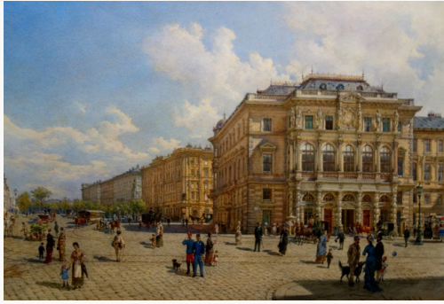
Fig. 21, Franz Alt, Archduke Ludwig Victor Palace , 1879. [view image & full caption]