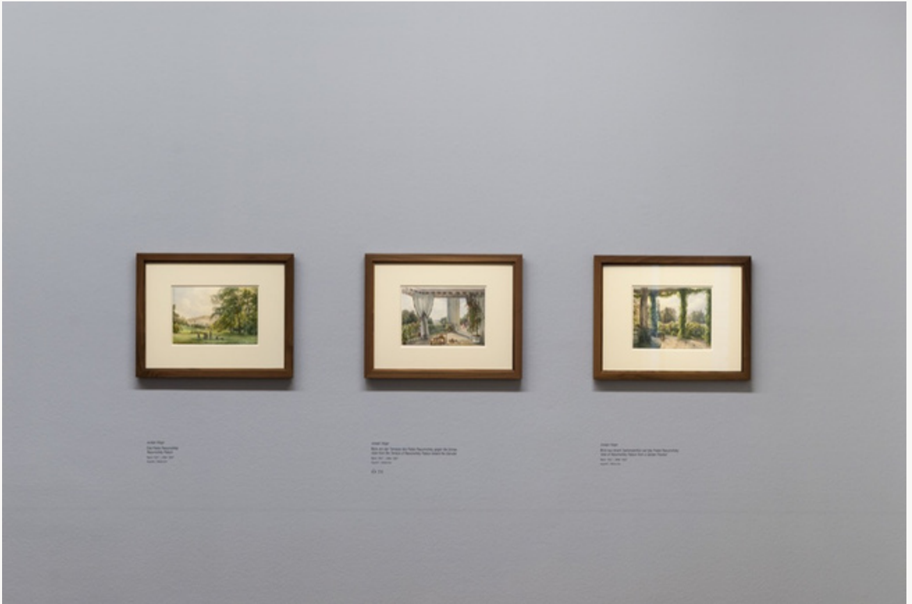
Fig. 8, Installation view of three exteriors by Joseph Höger: Rasumofsky Palace in its English Garden, View from the Terrace, View from a Garden Pavilion . All after 1837. [return to text]