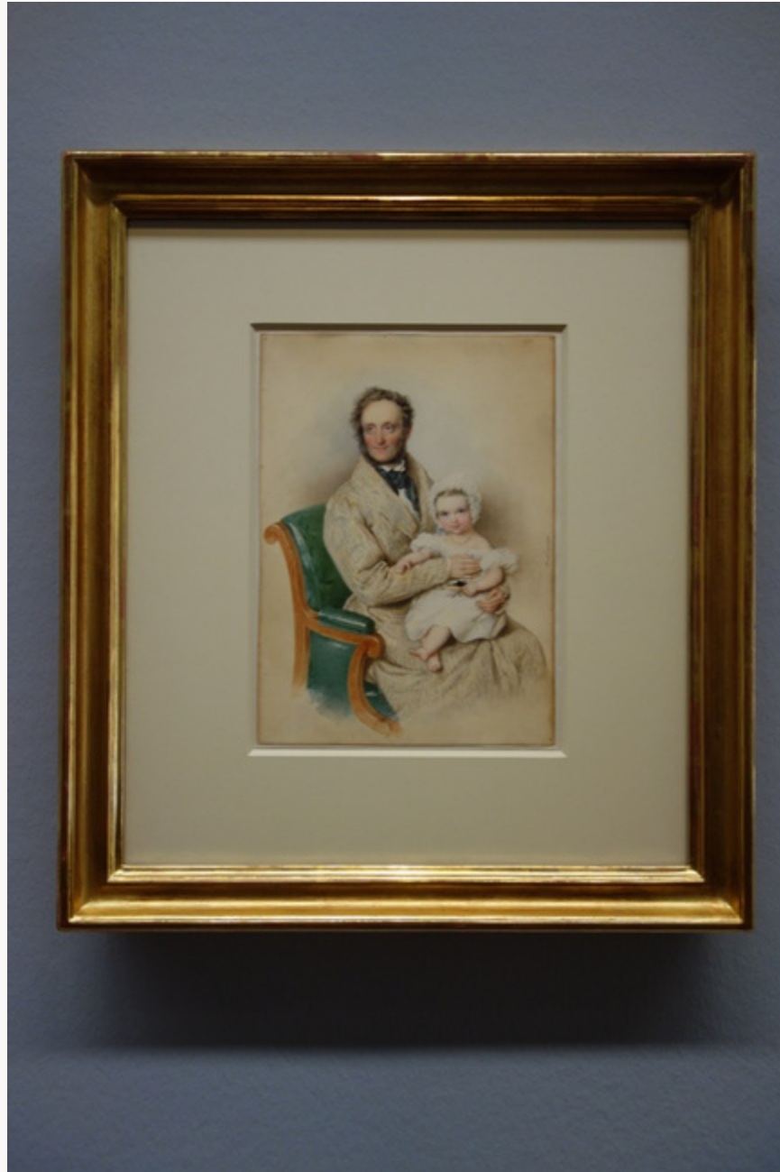
Fig. 4, Josef Kriehuber, Portrait of Prince Alois II von Liechtenstein with His Daughter Marie Franziska , 1835.