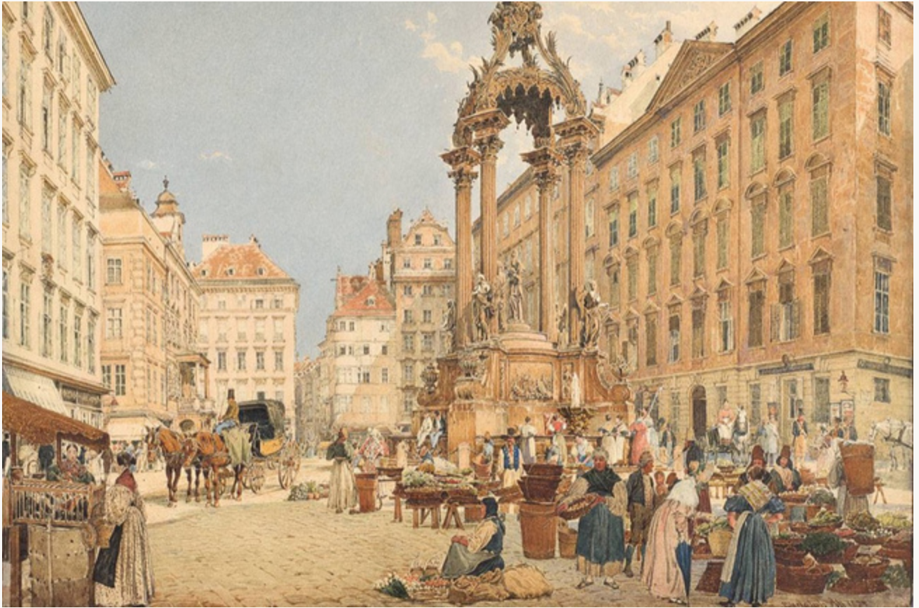
Fig. 22, Rudolf von Alt, Der Hohe Markt (The High Market), Vienna, 1836. [return to text]