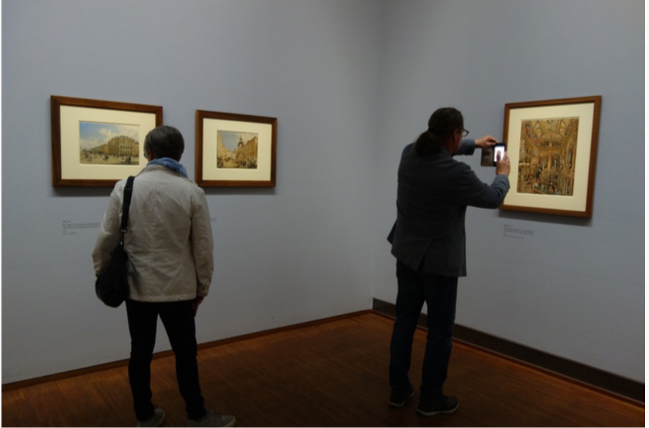
Fig. 20, Installation view, Franz Alt, Archduke Ludwig Victor Palace , Schwarzenbergplatz, Vienna, 1879; Rudolf von Alt, Der Hohe Markt , Vienna, 1836. [return to text]