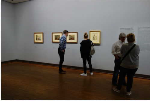
Fig. 3, Installation view, introductory wall, Rudolf von Alt und seine Zeit (Rudolf von Alt and his Times), Albertina, Vienna. [view image & full caption]