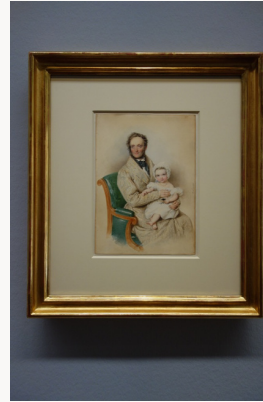
Fig. 4, Josef Kriehuber, Portrait of Prince Alois II von Liechtenstein with His Daughter Marie Franziska , 1835. [view image & full caption]