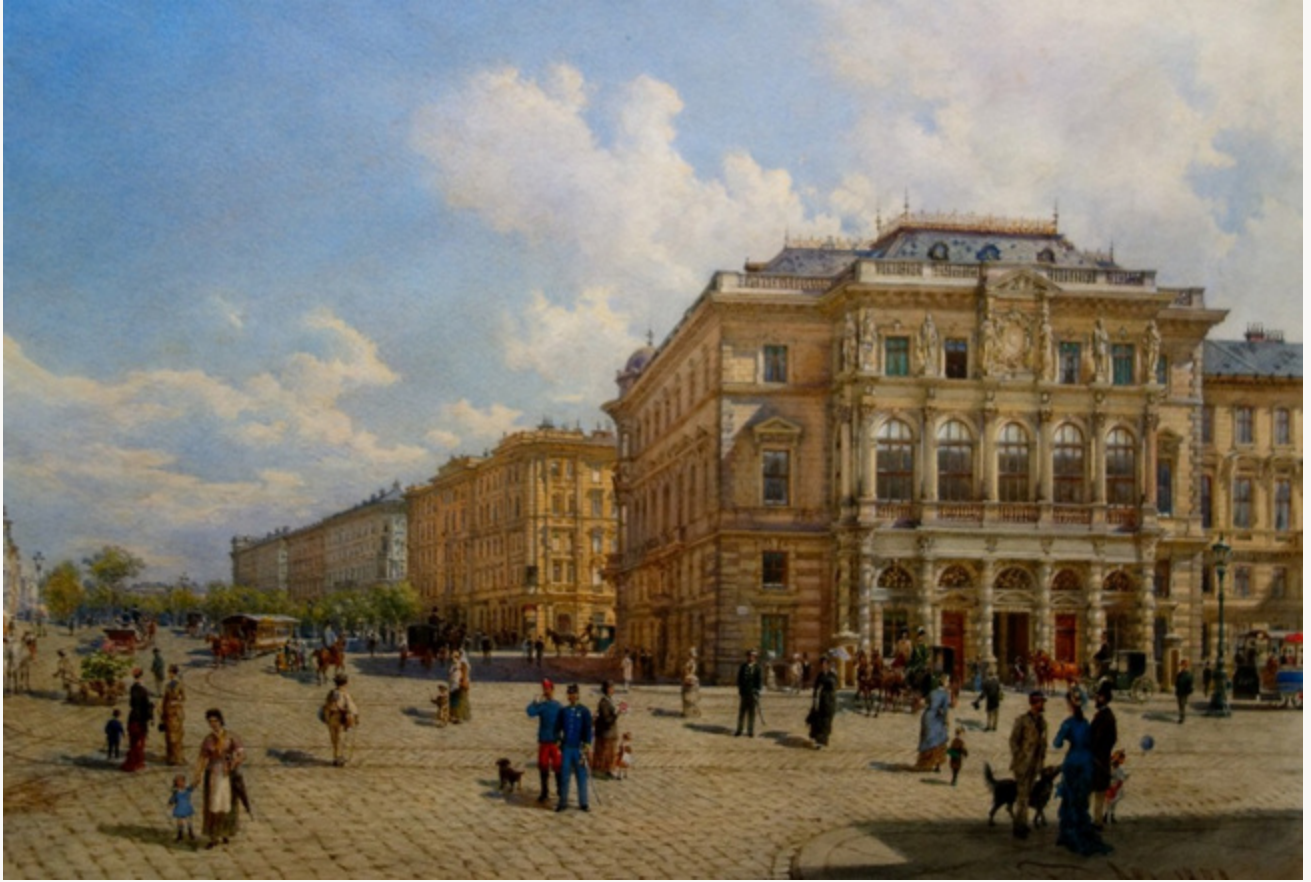
Fig. 21, Franz Alt, Archduke Ludwig Victor Palace , 1879. [return to text]