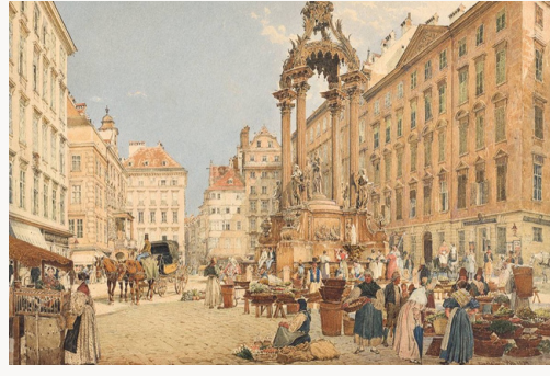
Fig. 22, Rudolf von Alt, Der Hohe Markt (The High Market) , Vienna, 1836. [view image & full caption]

The small sixth and last room of the show was a coda honoring the painter Thomas Ender (1793–1875). Entitled “Alpine Worlds,” the display included only four watercolors and two paintings. One other Ender watercolor, Ice Blocks on the Danube in the Augarten (1831), hung in the second room of the exhibition in a trio of winter landscapes by Höger and Friedrich Gauermann (1807–62). Ender’s delicate view of ice on the bank of the Danube had been acquired by Prince Franz Josef II in 1982, the same year he bought one of the two Ender oil paintings of glaciers in the watercolor show, The Vogelmaier Ochsenkar Kees (1834), displayed in the final room (fig. 23). Ender’s other work on canvas in this room, a prize acquisition by Prince Hans-Adam II in 2015, complements his father’s purchase with a view painted around 1830 of the Pasterze glacier beneath Austria’s highest mountain, the Grossglockner. The glacier is part of the High Tauern National Park, and Alexandra Hanzl, author of the catalogue entry in Rubens to Makart , points out the tiny figures on the ice in both paintings (nos. 92 and 93; fig. 24). She also mentions a grave reminder from the Austrian Alpine Association that as of 2017 eighty-two of the eighty-three glaciers under study show massive loss, and the largest, Pasterze, was judged to be “in a particularly poor state.” [14]