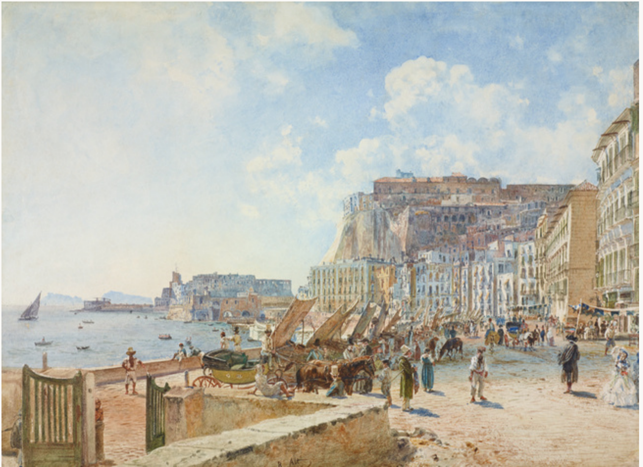
Fig. 19, Rudolf von Alt, Santa Lucia , Naples, 1835. [return to text]