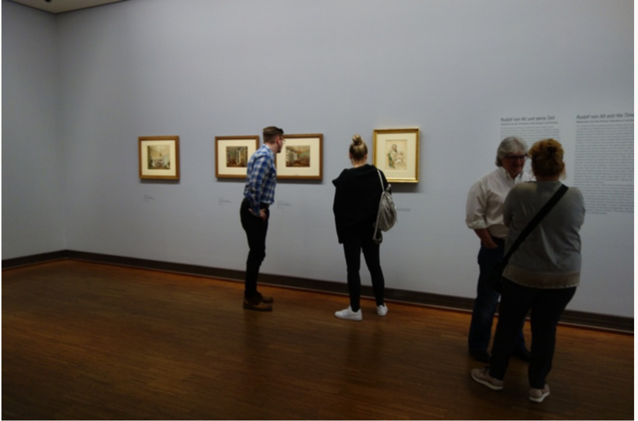
Fig. 3, Installation view, introductory wall, Rudolf von Alt und seine Zeit (Rudolf von Alt and his Times), Albertina, Vienna. [return to text]