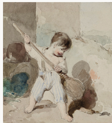
Fig. 16, Peter Fendi, Mouse Hunt , ca. 1834. [view image & full caption]

The ample space and explanatory wall texts of the fifth room allowed the visitor glimpses of Rudolf von Alt at work abroad under the rubric “Yearning for Distant Places” and at home in “The Changing City” (fig. 17). The generous placing of benches in the show was especially