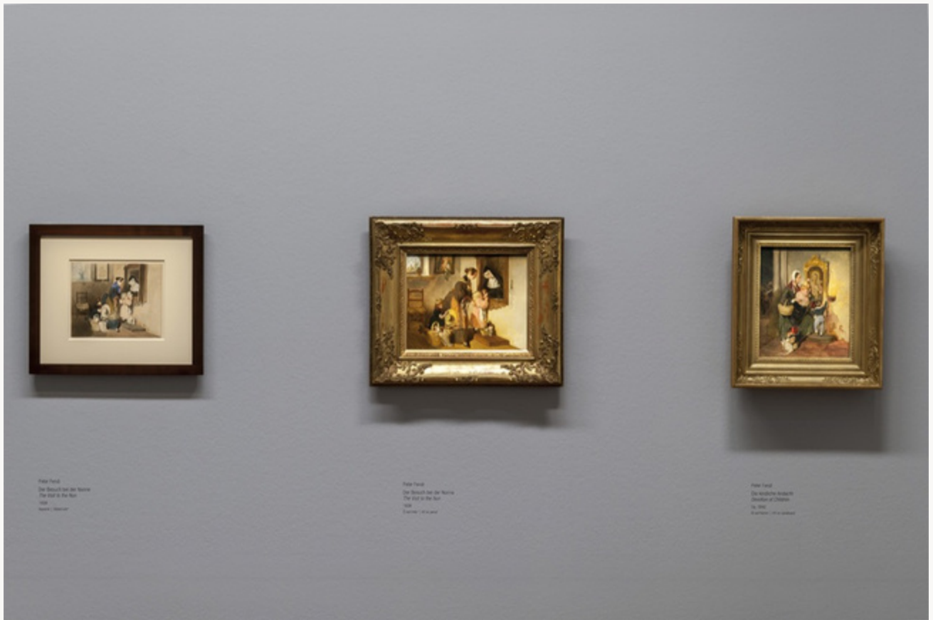
Fig. 14, Installation view, watercolor and oil painting by Peter Fendi, Visit to the Nun , 1839 and 1838, and Fendi's oil painting Childish Devotion , 1842. [return to text]