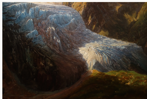
Fig. 24, Thomas Ender, View of the Upper and Lower Pasterze Glacier with Mount Grossglockner and Johannisberg near Heiligenblut , ca. 1830. [view image & full caption]