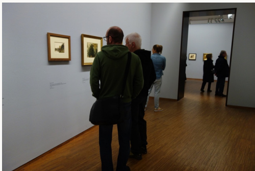
Fig. 10, Installation view, wall with Rudolf von Alt images of Lednice and Valtice, Moravia (Czech Republic). [view image & full caption]