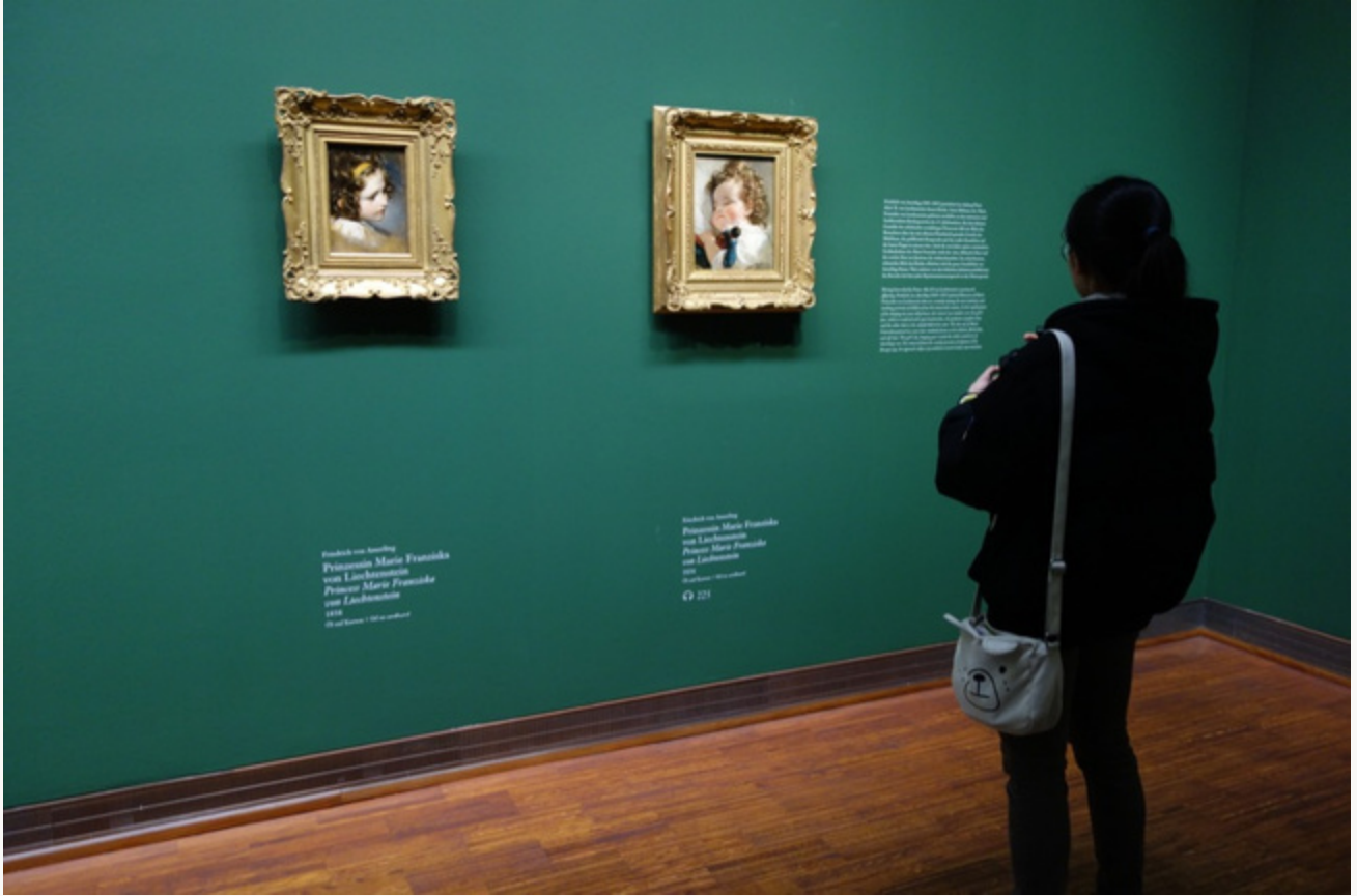
Fig. 5, Installation view, Friedrich von Amerling, left, Portrait of Princess Marie Franziska von Liechtenstein (1834–1909) at the Age of Four , 1838, and right, Marie Franziska at the Age of Two , 1836. Both oil on cardboard. Published in From Makart to Rubens (Vienna: Albertina, 2019), cat. nos. 80 and 79.