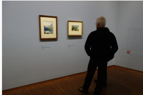
Fig. 9, Installation view, Lake Gosau by Joseph Höger, compared with Rudolf von Alt, Mödling landscape. [view image & full caption]

prince, and one sheet he purchased in 1987. The insightful hanging by the curators offered several opportunities to compare works by two artists side by side. The first pairing in the second room was a vertical Höger vista of Lake Gosau Facing the Dachstein , a classical Salzkammergut motif from the 1836 series (sheet 14), hanging to the left of a horizontal view by Alt dated, surprisingly, 1827 (fig. 9). Alt would have been around fifteen when he produced three views in Mödling, a town some fourteen miles south of the city in the Vienna Woods. The sheet, hung next to the Höger, was purchased in 1906—the year following Alt’s death—by his admirer Prince Johann II von Liechtenstein.[8]