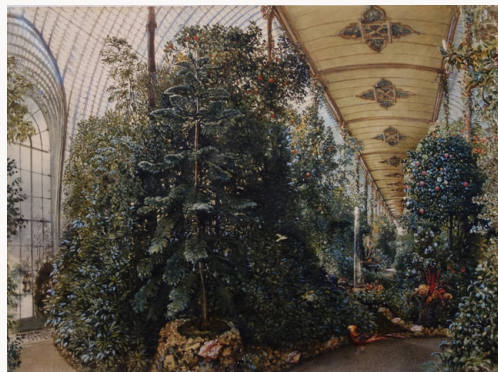
Fig. 11, Rudolf von Alt, Palm House, Lednice , 1842. [view image & full caption]