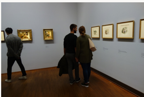
Fig. 12, Installation view, portraits by Peter Fendi of the children of Prince Alois II and Princess Franziska, 1840–41. [view image & full caption]