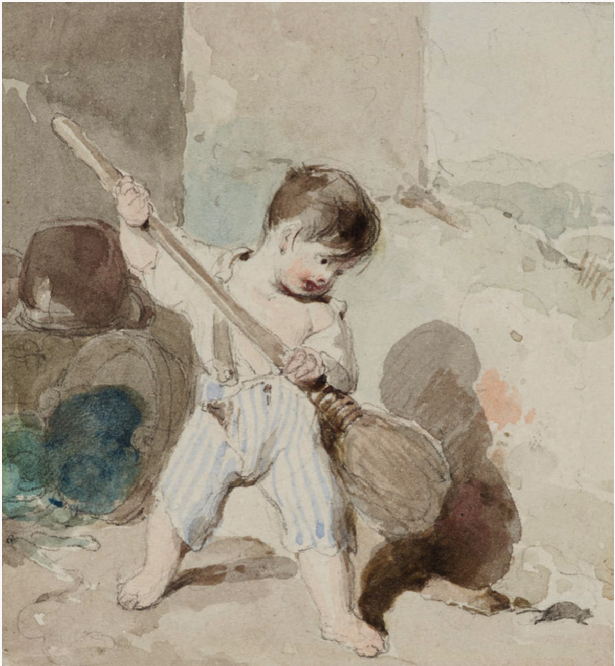
Fig. 16, Peter Fendi, Mouse Hunt , ca. 1834. [return to text]