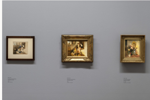
Fig. 14, Installation view, watercolor and oil painting by Peter Fendi, Visit to the Nun , 1839 and 1838, and Fendi's oil painting Childish Devotion , 1842. [view image & full caption]

(auctioned in 1880 and now in the National Gallery, London) and Massacre of the Innocents (sold in 1921 and now in the Thomson Collection, Art Gallery of Ontario, Toronto).[10] Two oil paintings by Fendi, described in Rubens to Makart , hung appropriately with the watercolors in the third room (fig. 14). Visit to the Nun was a favorite subject for the artist, and exhibition viewers could compare the oil on panel from 1838 with a watercolor from the following year.[11]