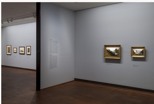
Fig. 23, Installation view, Alpine subjects by Thomas Ender. [view image & full caption]