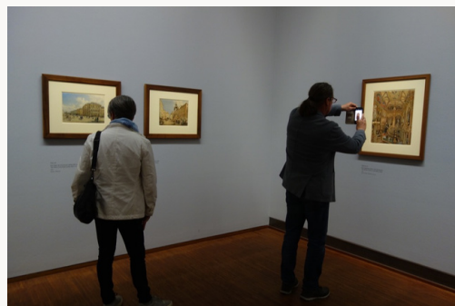
Fig. 20, Installation view, Franz Alt, Archduke Ludwig Victor Palace , Schwarzenbergplatz, Vienna, 1879; Rudolf von Alt, Der Hohe Markt , Vienna, 1836. [view image & full caption]