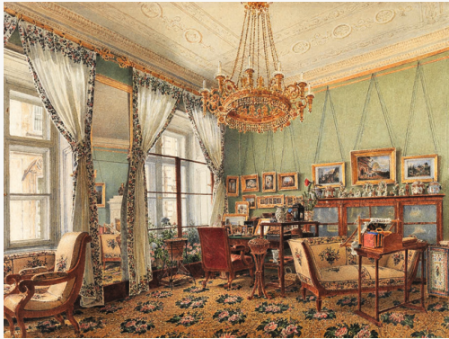
Fig. 6, Rudolf von Alt, Salon in the Rasumofsky Palace , 1836. [view image & full caption]

prince rented, then bought the house from the widow of the retired Russian ambassador, who died in September 1836. [7] Some thirty years earlier three remarkable string quartets commissioned by Prince Andrey Kirillovich Rasumofsky from Ludwig van Beethoven gave the Russian art patron's name an enduring fame. Visitors, moving close enough to the watercolors to savor details in the furniture, floors and fabrics, noticed that Alt had included Kriehuber's framed portrait of Alois II and his young daughter in two of his three pictures of the Rasumofsky palace drawing rooms (figs. 6, 7).