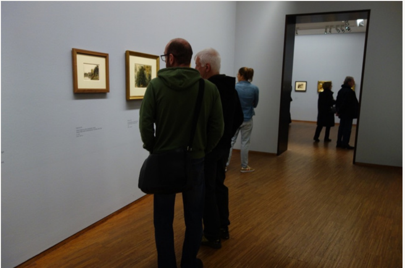
Fig. 10, Installation view, wall with Rudolf von Alt images of Lednice and Valtice, Moravia (Czech Republic). [return to text]