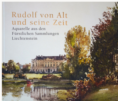
Fig. 2, Catalogue cover, Rudolf von Alt und seine Zeit (Rudolf von Alt and his Times), 2019. [view image & full caption]

Since the Liechtenstein Museum closed in 2012, the anniversary exhibition offered the first opportunity to see beloved masterworks by Rubens (1577–1640), Adriaen de Vries (ca. 1556–1626), Friedrich von Amerling (1803–87) and many other artists in a new context at the Albertina. Spectacular recent purchases studded both parts of the show. Most visitors attended Part One, captivated by publicity posters lining the city streets with Rubens’s portrait of his daughter Clara Serena (ca. 1616), one of Johann Adam Andreas I’s numerous works by the Flemish painter.