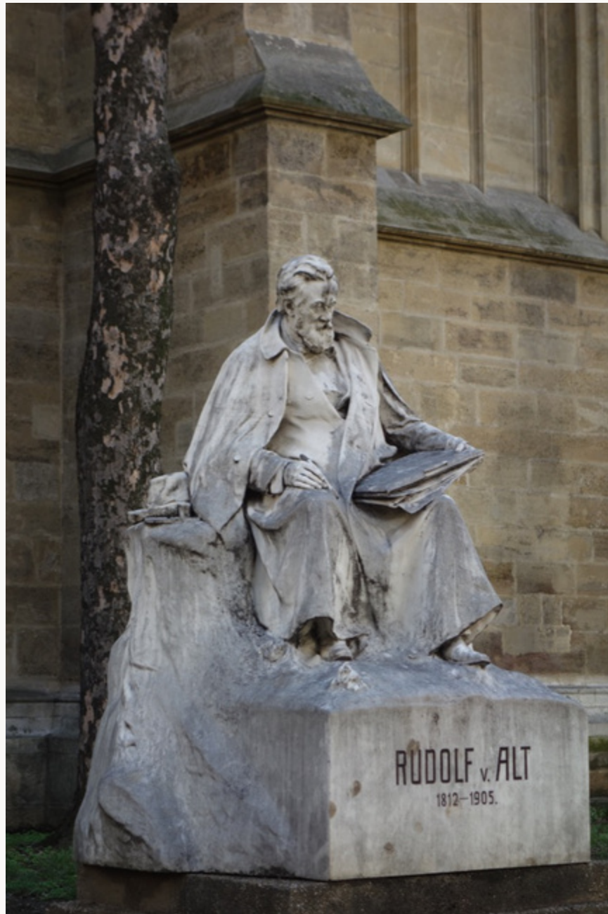
Fig. 26, Hans Scherpe, Rudolf von Alt Monument , 1912, stone. Minoritenplatz, Vienna. [return to text]