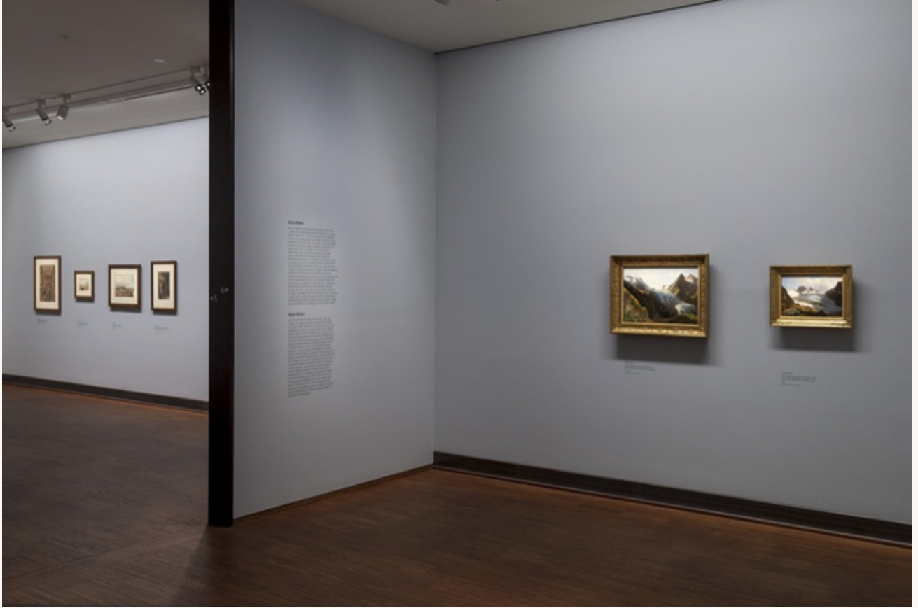
Fig. 23, Installation view, Alpine subjects by Thomas Ender. [return to text]