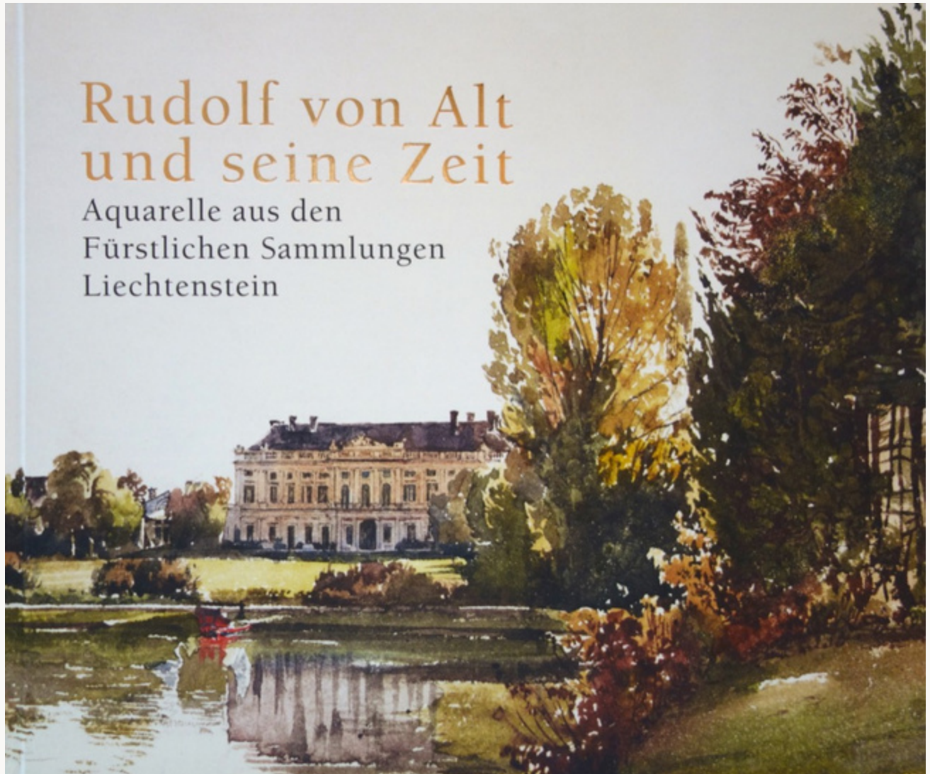
Fig. 2, Catalogue cover, Rudolf von Alt und seine Zeit (Rudolf von Alt and his Times), 2019. Cover image: Alt's watercolor of Lednice, Czech Republic, ca. 1830. [return to text]