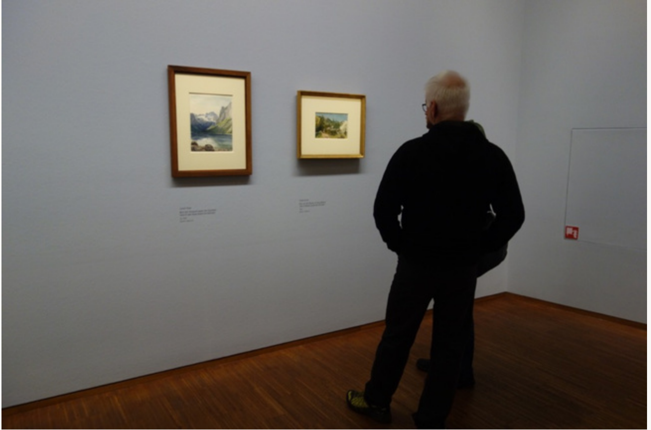
Fig. 9, Installation view, Lake Gosau by Joseph Höger, compared with Rudolf von Alt, Mödling landscape. [return to text]