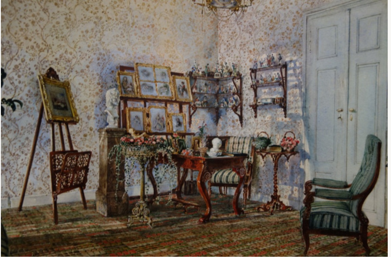
Fig. 7, Detail of Rudolf von Alt, Salon in the Rasumofsky Palace , 1836. [return to text]