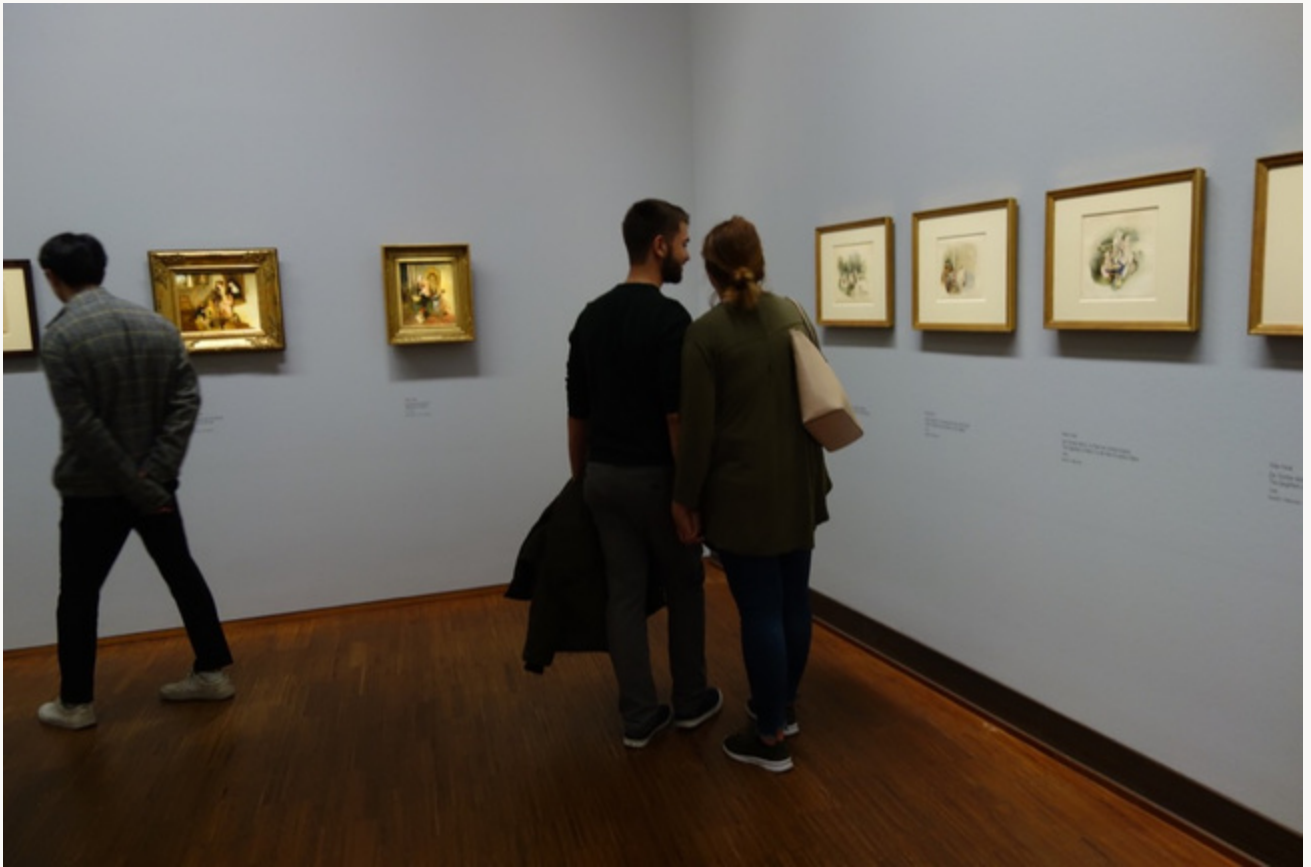
Fig. 12, Installation view, portraits by Peter Fendi of the children of Prince Alois II and Princess Franziska, 1840–41. [return to text]