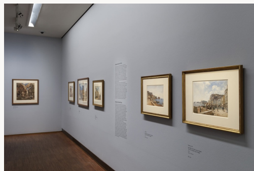
Fig. 18, Installation view, wall with Naples views by Jakob Alt (left) and Rudolf von Alt (right), 1835. [view image & full caption]