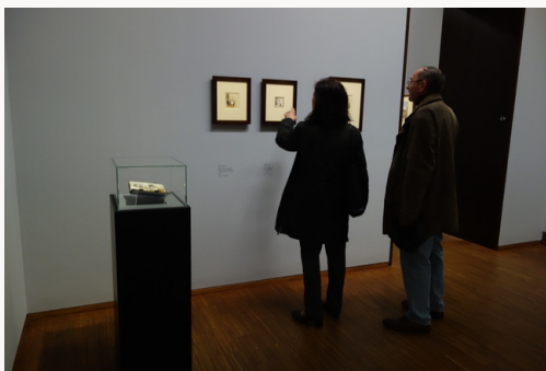
Fig. 15, Installation view, vitrine with Peter Fendi sketchbook, 1831. [view image & full caption]

The fourth room in the show was also devoted to Fendi, with ten of his watercolors and two by his pupil Carl Schindler (1821–42); all but one were purchased for the collection after World War II. A vitrine held a Fendi sketchbook, a major acquisition in 1981 by Prince Franz Josef II, who bought four more Fendi works in 1982–83 (fig. 15). His son, Hans-Adam II, would not only continue but escalate the campaign to fill gaps in the Biedermeier holdings massively depleted by Prince Johann II's donations to the Wien Museum and other public collections from 1894 to 1916.[12] Fendi's Mouse Hunt (ca. 1834) was one of Prince Hans-Adam II's acquisitions of 2015 (fig. 16). Another was Hide and Seek (1838; cat. 77), featured on the cover of an auction catalogue in 1924.[13]