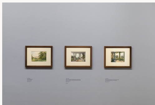
Fig. 8, Installation view of three exteriors by Joseph Höger: Rasumofsky Palace in its English Garden , View from the Terrace , View from a Garden Pavilion . [view image & full caption]

On the adjacent wall hung three equally charming exterior views of the palace and grounds by Joseph Höger (1801–77): the neo-classical building set in an English-style garden, a vista from its terrace, and another from a garden pavilion (fig. 8). The prince appointed Höger as drawing master to his children, and sometimes invited the artist to accompany him on his trips. In 1818, nearly a century after the founding of the Principality, the twenty-two-year-old Alois II traveled to Liechtenstein. More curious than his predecessors, in 1842 he became the first reigning prince to visit Vaduz, the place to which they owed their princely status.