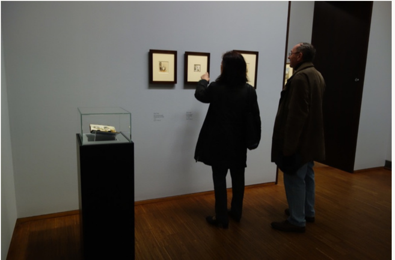
Fig. 15, Installation view, vitrine with Peter Fendi sketchbook, 1831. [return to text]