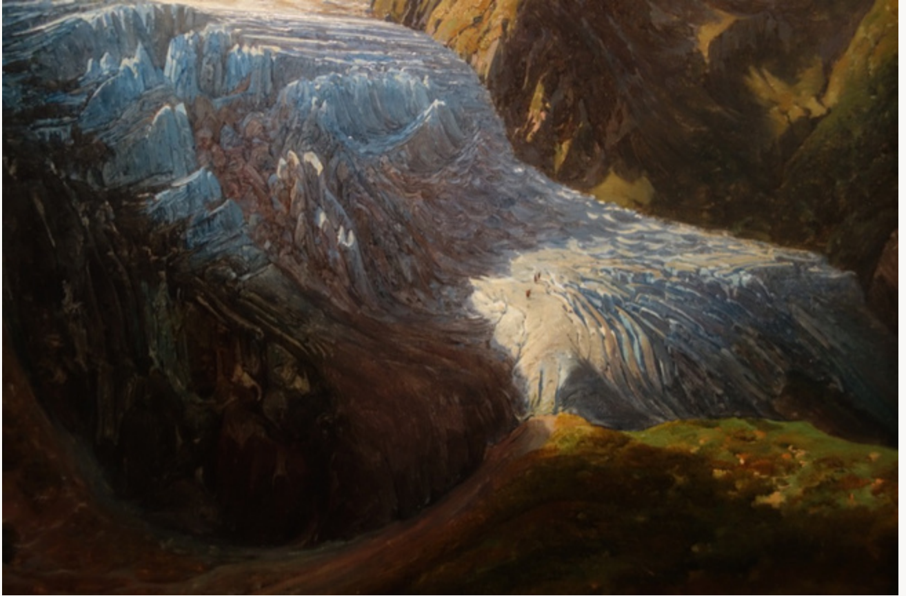
Fig. 24, Thomas Ender, View of the Upper and Lower Pasterze Glacier with Mount Grossglockner and Johannisberg near Heiligenblut , ca. 1830. Oil on canvas. [return to text]