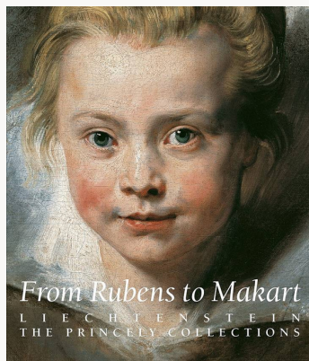
Fig. 1, Catalogue cover, From Rubens to Makart , 2019. [view image & full caption]