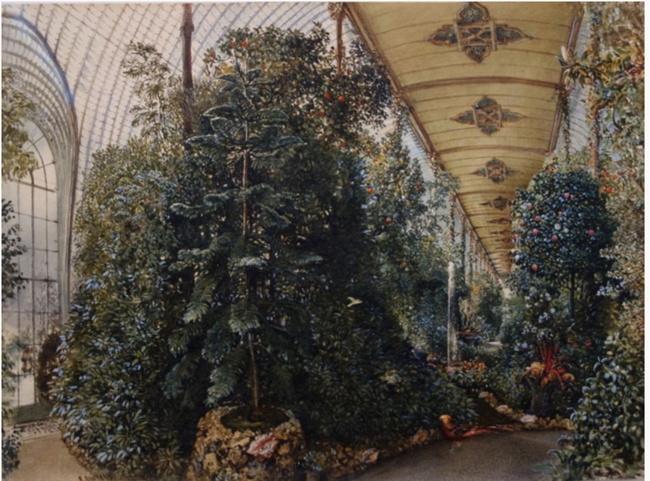
Fig. 11, Rudolf von Alt, Palm House, Lednice , 1842. [return to text]