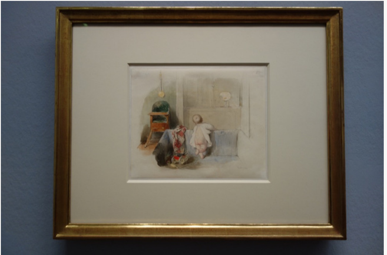
Fig. 13, Peter Fendi, Prince Johann II in a Playpen , 1841. [return to text]