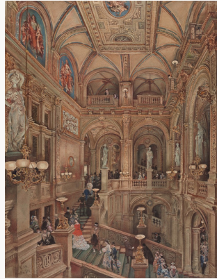
Fig. 25, Rudolf von Alt, Staircase, Hofoper (Staircase, Court Opera), 1873. [view image & full caption]