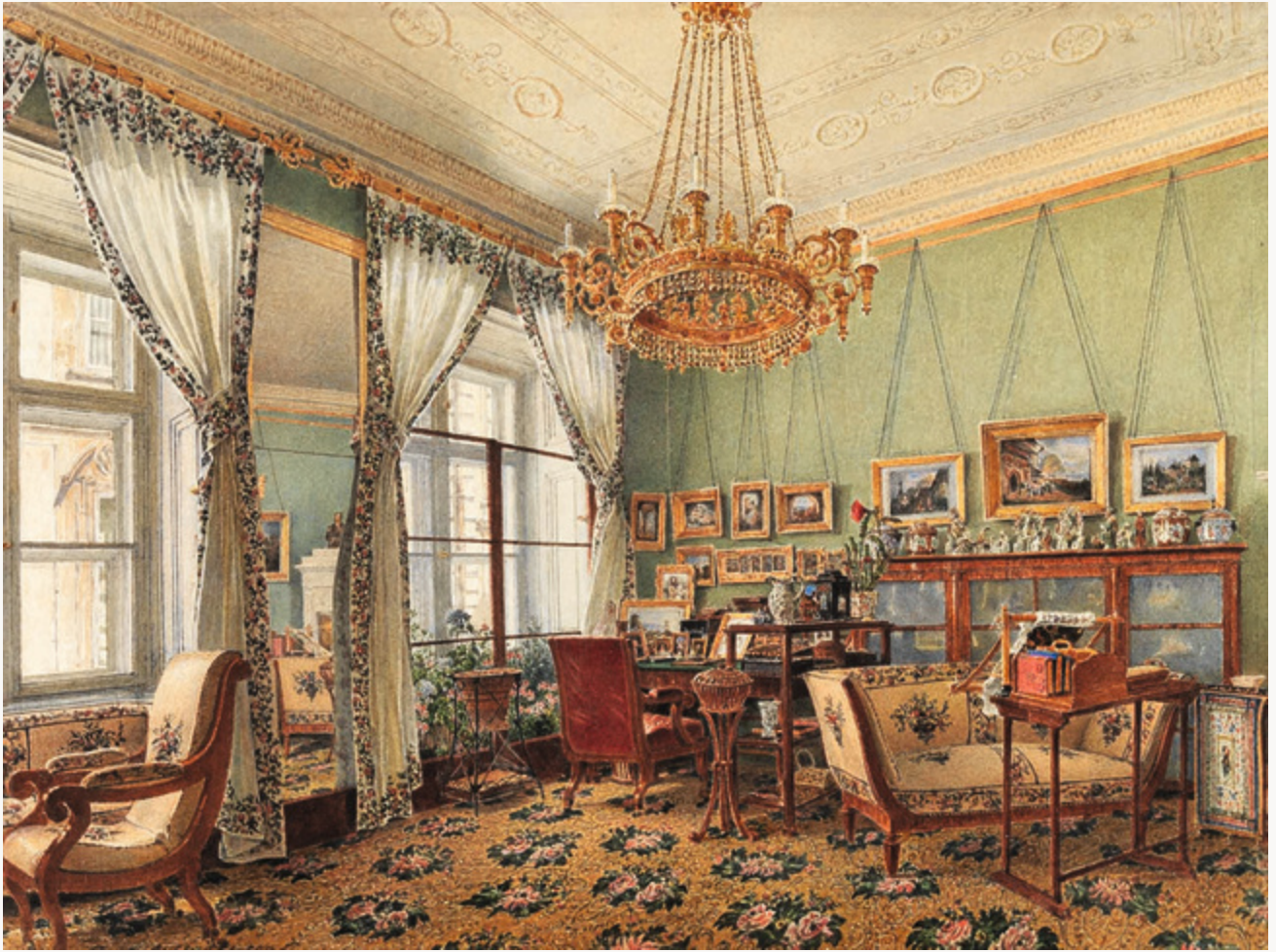
Fig. 6, Rudolf von Alt, Salon in the Rasumofsky Palace , 1836. [return to text]