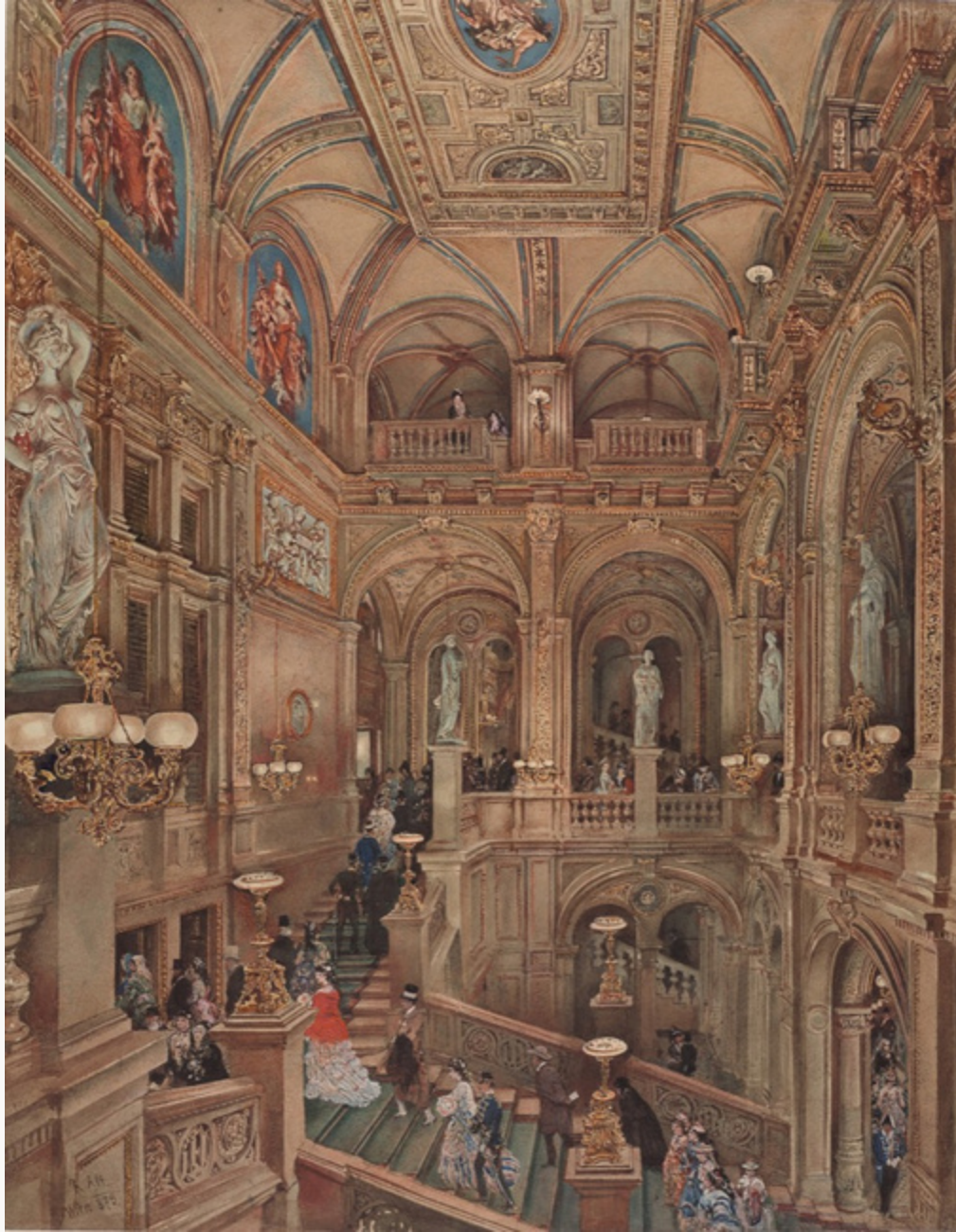
Fig. 25, Rudolf von Alt, Staircase, Hofoper (Staircase, Court Opera), 1873. [return to text]