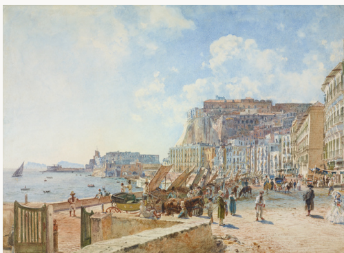
Fig. 19, Rudolf von Alt, Santa Lucia , Naples, 1835. [view image & full caption]