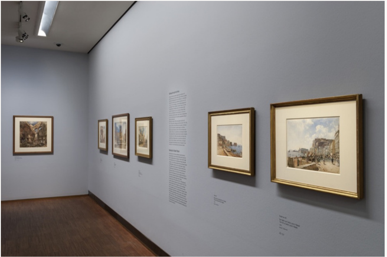
Fig. 18, Installation view, wall with Naples views by Jakob Alt (left) and Rudolf von Alt (right), 1835.