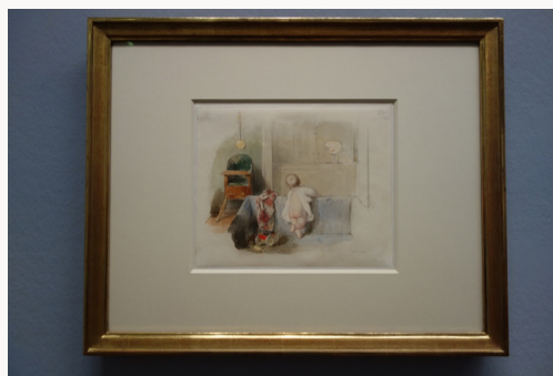
Fig. 13, Peter Fendi, Prince Johann II in a Playpen , 1841. [view image & full caption]